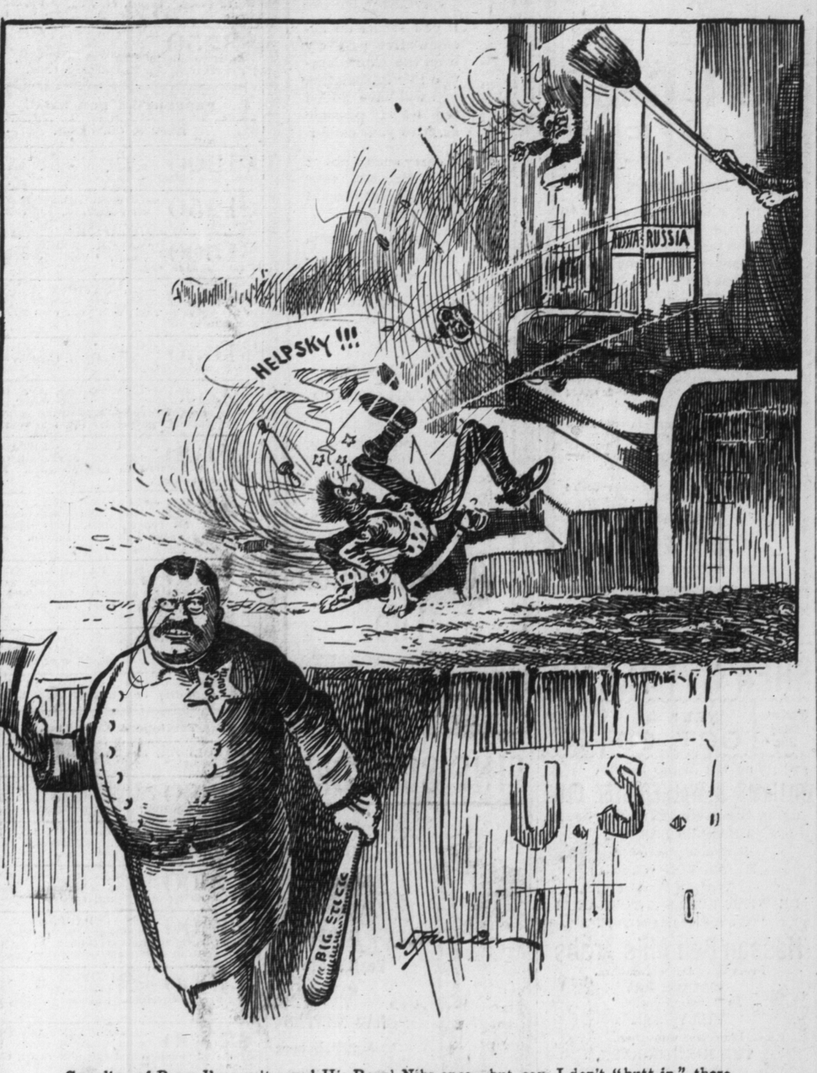
Guardian of Peace Roosevelt saved His Royal Nibs once—but, say, I don't "butt in" there.