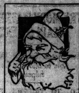
"Everybody Says the Same: Useful Gifts this Year." —SANTA CLAUS

WARD SIX LIBERALS TO MEET. On Thursday night at their club-rooms, 234 Gladstone avenue, the Ward Six Liberal Association will hold a "multiphase" night when all the candidates for the mayoralty, board of control and aldermen and members of the board of education for Ward Six will be invited to speak. The public are cordially invited to attend.