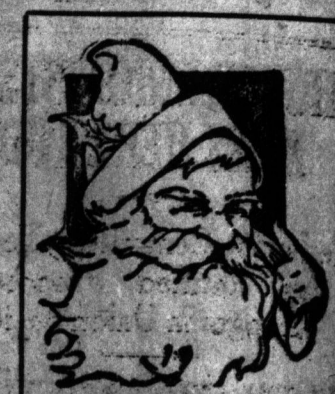
"Everybody Says the Same: Useful Gifts this Year." —SANTA CLAUS

Wonderful Offering of Leather Goods, Fitted Manicure Case, Hand Bags, etc., Worth $4.50 for $1.50. When we mention that the various articles of leather to be on sale at $1.50 Thursday are regular $3.00 to $4.50 values, when we add that every article is fresh from the maker's, never having been out of the original boxes, you'll feel that this is a bargain in which you will want to share.