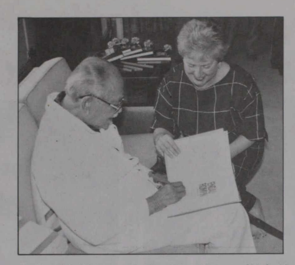
Tunku Abdul Rahman, the first Prime Minister of Malaysia and patron of the Endau-Rompin expedition, autographs a copy of "Endau-Rompin — A Malaysian Heritage" for Canadian High Commission Development Counsellor Anne Sutherland

The objectives of the book were not limited to the documentation of the expedition and the raising of the project's profile. It also underlines the importance of striking a balance between development and the environment, and the need to place more emphasis on prevention through conservation rather than on curative mea-