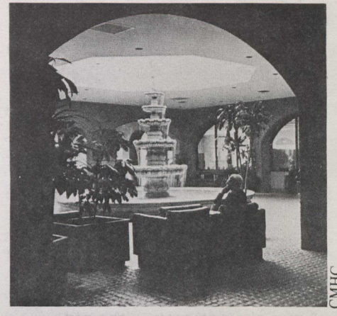
The old-world style courtyard.

This unique experiment was realized through the hard work and imagination of members of the Canadian-Italian Benevolent Corporation, which owns and operates the $4.6-million home. After careful investigation of several similar Italian homes that had been established in the United States, the financial groundwork for the project was laid through a fund-raising dinner, personal canvass and