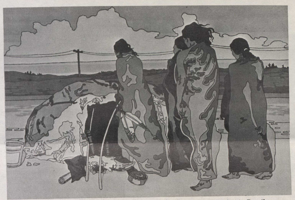
In a Sweatlodge, by Leonard McLeod, one of the works now on display in Brazil.

The works include intricate stone sculptures as well as wood sculptures in the form of traditional Indian masks, rattles and bowls. The masks, probably