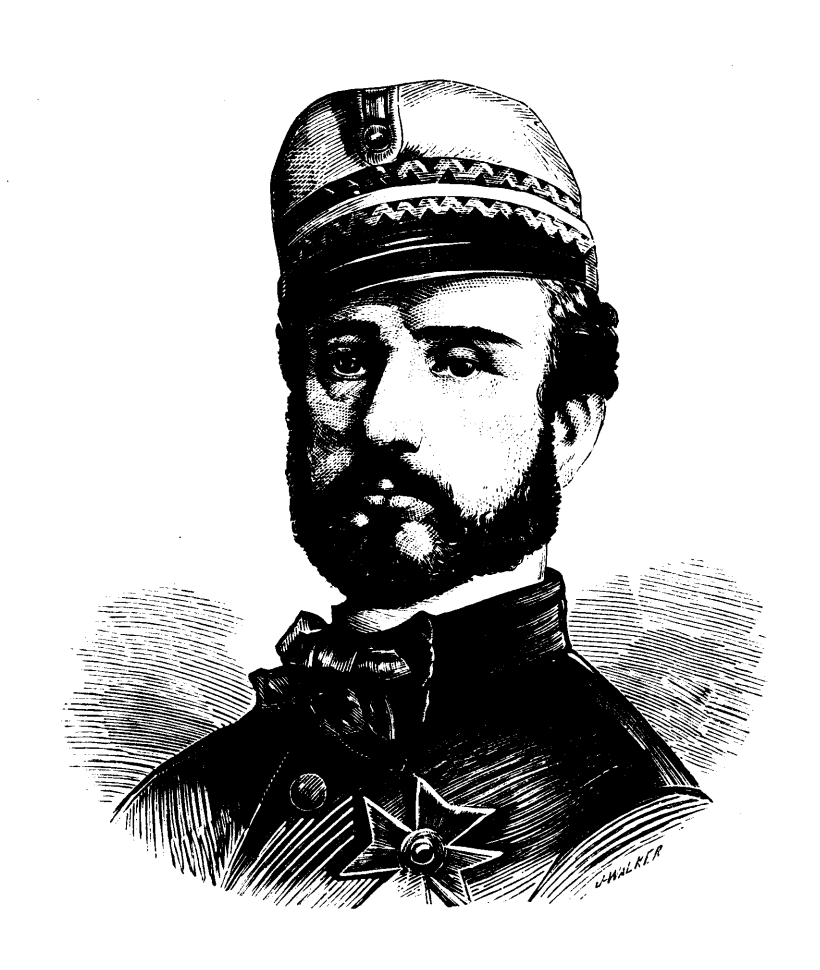
THE LATE GENERAL PRIM.