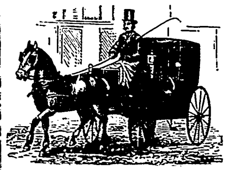
En Connection with Telephone from all parts of the City.