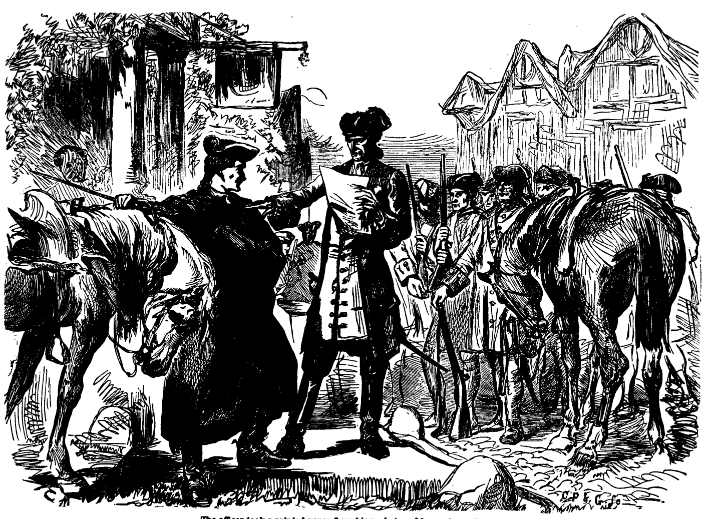
The officer took a printed paper from his pocket, and began to read aloud.