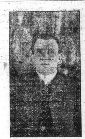
TO THE ELECTORS OF THE DIS-

tion of Act to Coal Strike. Lethbridge, Alta., April 24.-The