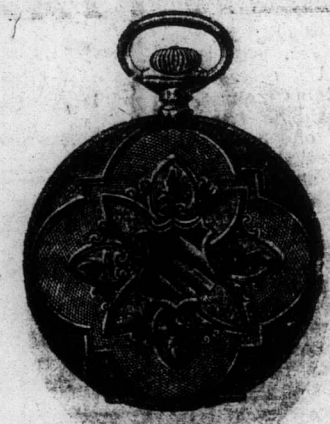
On Exhibition at BULLER BROS. and NEW- MAN AND SONS' Jewelry Stores.