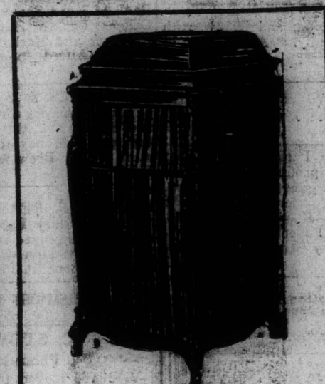
On Exhibition at CHAS. BROWN'S and T. J. BARTON AND SON'S Music Stores.

Organization Counts! Attention Candidates!