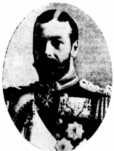
H.R.H. the Duke of Cornwall and York.

When the Royal party arrive at Halifax on October 19th, they will have travelled more than seven thousand miles on Canadian soil, and will have met with a united people, whose heritage is half a continent and whose future promises more than that of any other portion of the Empire. They will