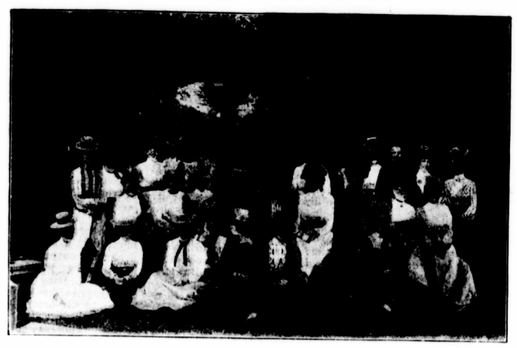
Annual Meeting of the South Bruce Women's Institute, held at Walkerton, Ont., June, 1901.