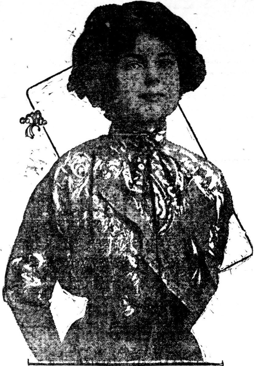
The Persian effect in shirtwaists, which appear in what are commonly called "tablecloth shirtwaists," are the rage of the season.