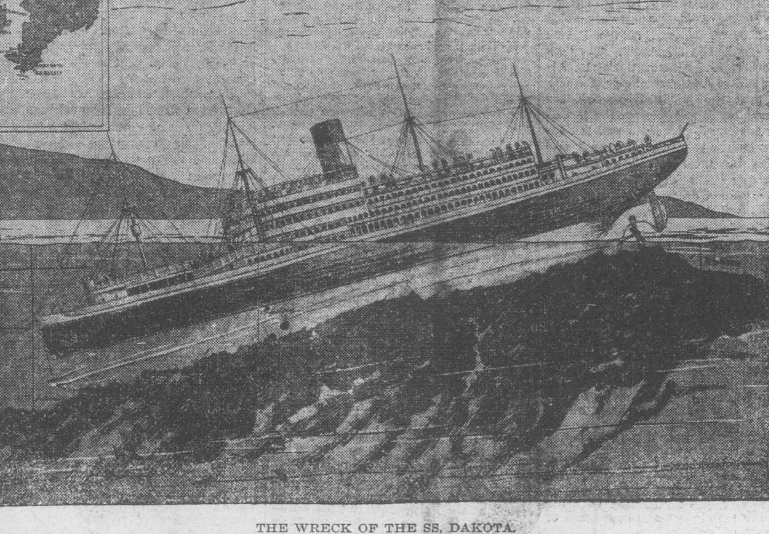
THE WRECK OF THE SS. DAKOTA. A Sketch Showing the Liner as She Lies on the Devil's Reef.

Ceremony Held Yesterday to Mark THE HEALTH OF