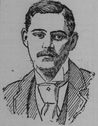
Teller of the Canadian Bank of Commerce at Skaguay, who figured in Tuesday's attempted hold-up.

Seattle, Wash., Sept. 17.—A special to The Times from Skaguay, Alaska, says about 3 o'clock yesterday afternoon an unknown man walked into the Canadian Bank of Commerce, a revolver in one hand and a dynamite bomb in the other, and demanded $20,000, threatening to blow all into eternity.