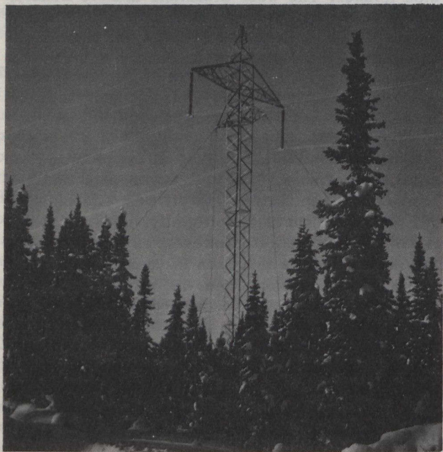
A majestic pine seems to vie in height with a 175-foot tower structure on the Nelson River transmission-line in northern Manitoba. Now completed, the line, carrying electricity from northern to southern Manitoba, comprises 4,114 towers stretching 550 miles across some of the world's most difficult terrain.

Construction of one of the world's largest transmission-line projects has been completed. The line, built by Atomic Energy of Canada Limited as part of the Nelson River transmission facilities, will bring electricity from Manitoba Hydro's Kettle Generating Station to southern Manitoba. Five hundred and fifty miles long, the line will operate at 900,000 volts direct current, the highest DC voltage used in the world.