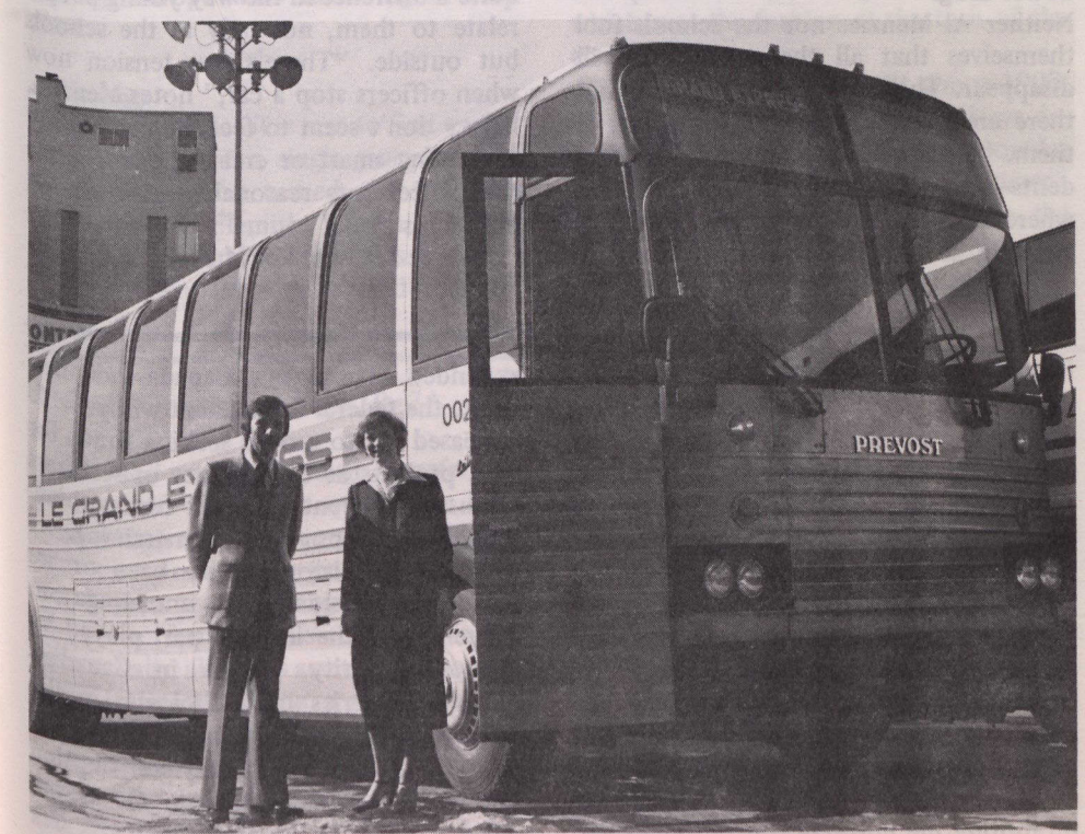
Norman Denault (above), Vice President of Marketing for Voyageur Inc., who announced the inauguration of a new "deluxe" bus service between Montreal and Quebec City, is shown with one of the hostesses working on the Grand Express.

The $130,000-vehicles have 24 seats, compared to 43 or 47 on the regular buses, built in rows of three instead of the usual four. Each seat has a control panel from which four types of music may be chosen, lights adjusted or hostess called. There are four departures a day – $21 single, $42 return fare, which includes meals, newspapers and magazines. Regular return bus fare for the 24-kilometre journey from Montreal to Quebec City is $19.80.