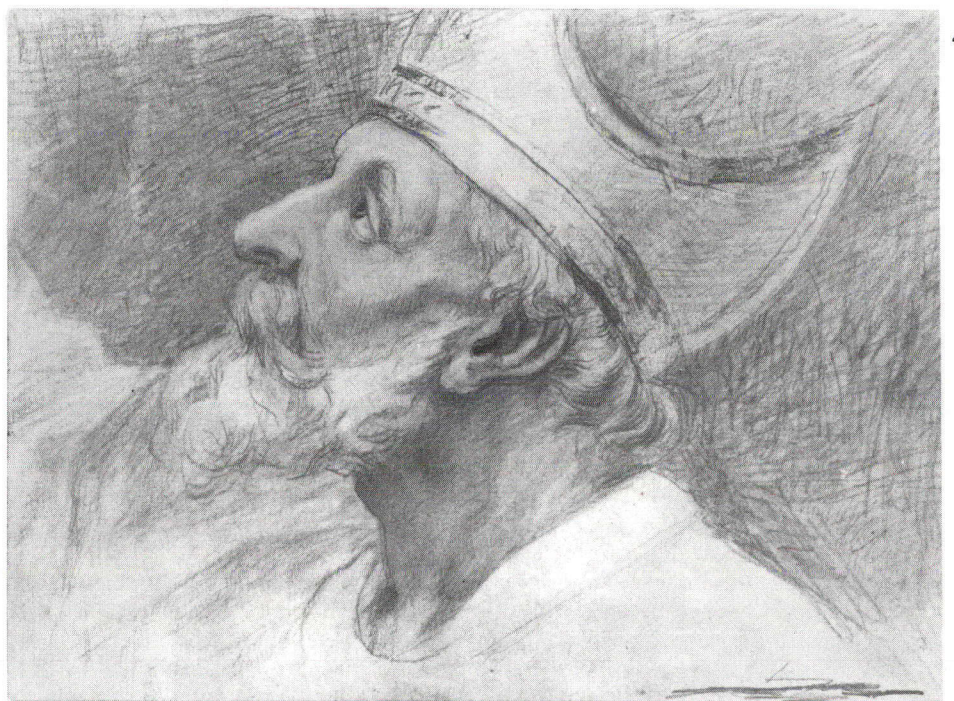
4. Saint Hilary Raising the Child who had Died Without Baptism (1891).