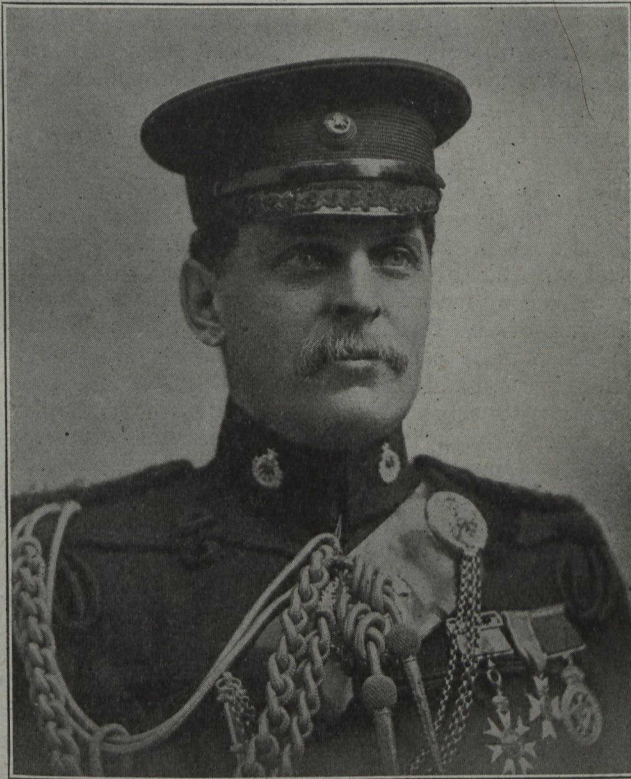
COLONEL SIR PERCY SHERWOOD, K.C.M.G., M.V.O., A.D.C., Chief Commissioner of Police for Canada.

Law and good order are so much the prevailing condition in Canada that the public has come to have an impression that a remarkable freedom from crime or disturbance is an inherent characteristic of the Dominion. So, perhaps it is. Canadians are a people given to common honesty and the observance of their laws. But can it be supposed for a moment that a great, rich,