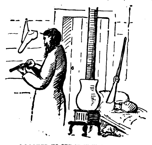
I LOOKED TO SEE IF IT WAS LOADED.

comfortably furnished. appeared at the kitchen door, if I could remain for the night; she said yes, and then I removed my overcoat and sat me down in an arm chair by the little vaseshaped coal stove and looked about me. On the other side of the stove, rather too near it to be comfortable, was a sofa, a cat lying on it, and a brown retriever under it. It was covered with a handsome brightcolored Navajo blanket. A small clock hung on the wall. The walls and ceiling were rough boards whitewashed; the floor had a red and black carpet, with a grey drugget and some rag mats over it; a small table covered with newspapers of very various dates, stood by the little curtained window; a larger table, capable of seating six men, with a white cloth on it, and a cruet stand, stood near the entrance door and extended nearly across the little room; the only other article of furniture, beside the yellow chairs, was a book-shelf containing a few well-thumbed novels, and, on the top