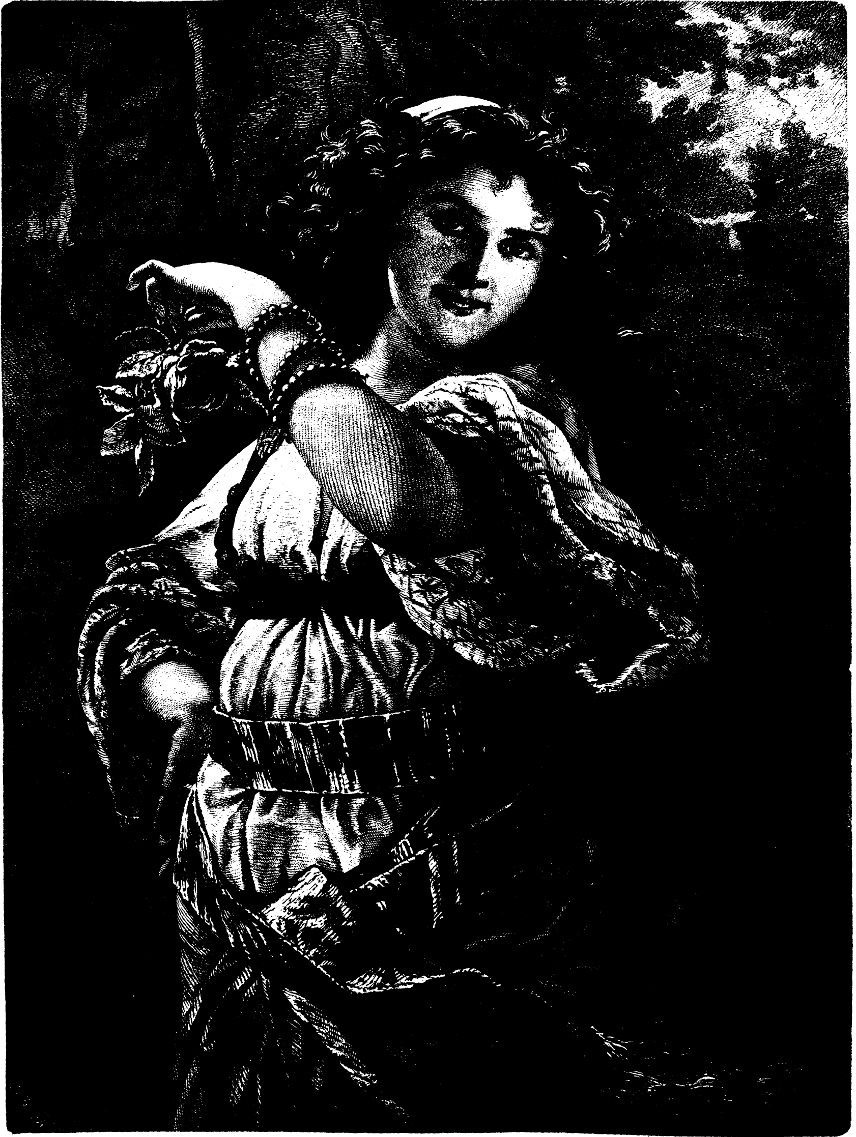
AN EGYPTIAN ALMEH.