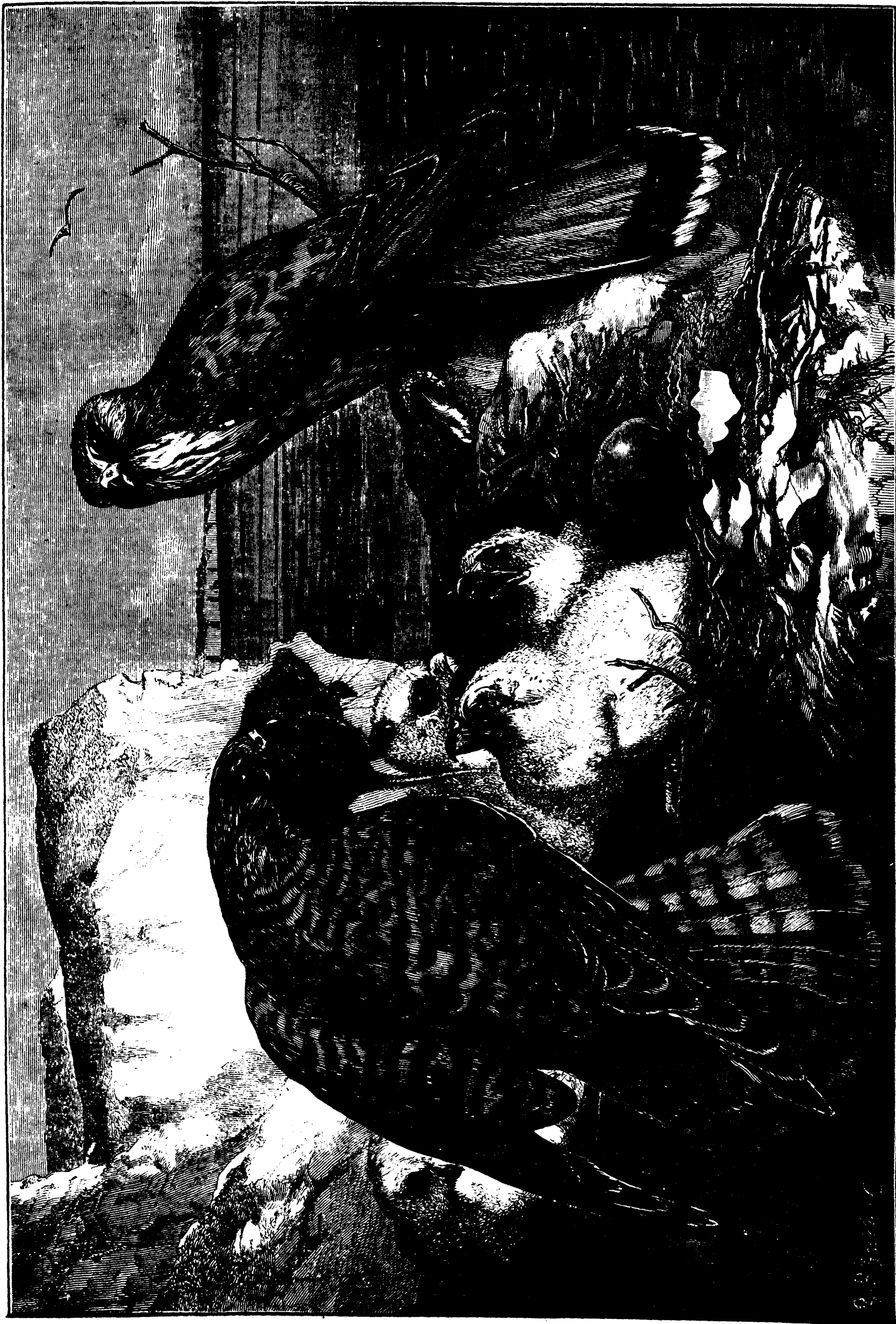
THE MONTHS: JUNE.