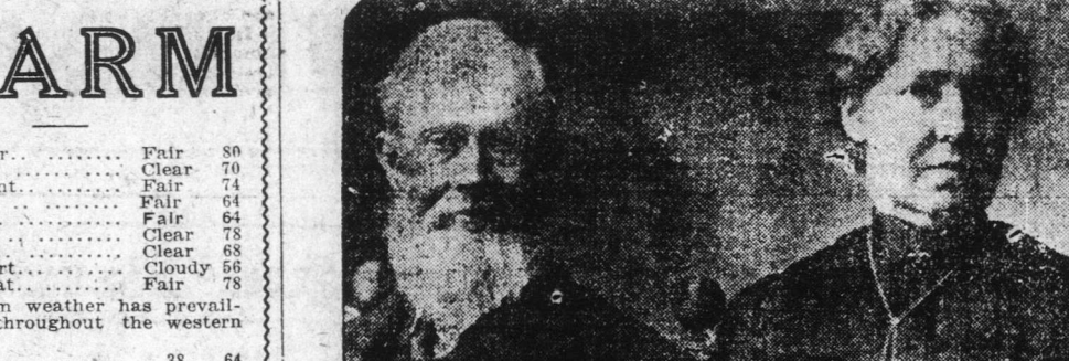
A GOLDEN WETDDING.

the idea is all very well in theory, but is more d'fficult in practice. Like seeks like, the two generations do not always m's. A natural and inevitable gap separates them. Between the old and the young real friendship is only possible upon the condition that the old shall never be exacting. To be exacting is to be a bore and