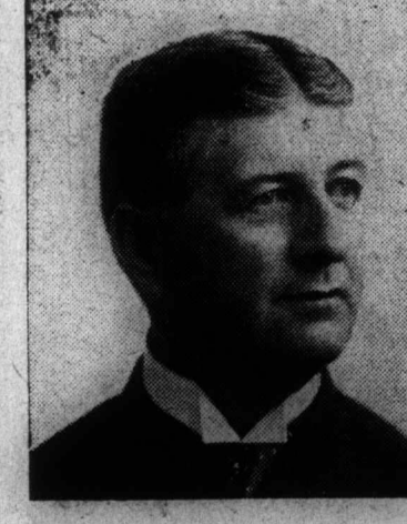
Who is mentioned as a member of the new Street Railway Commission for the city.