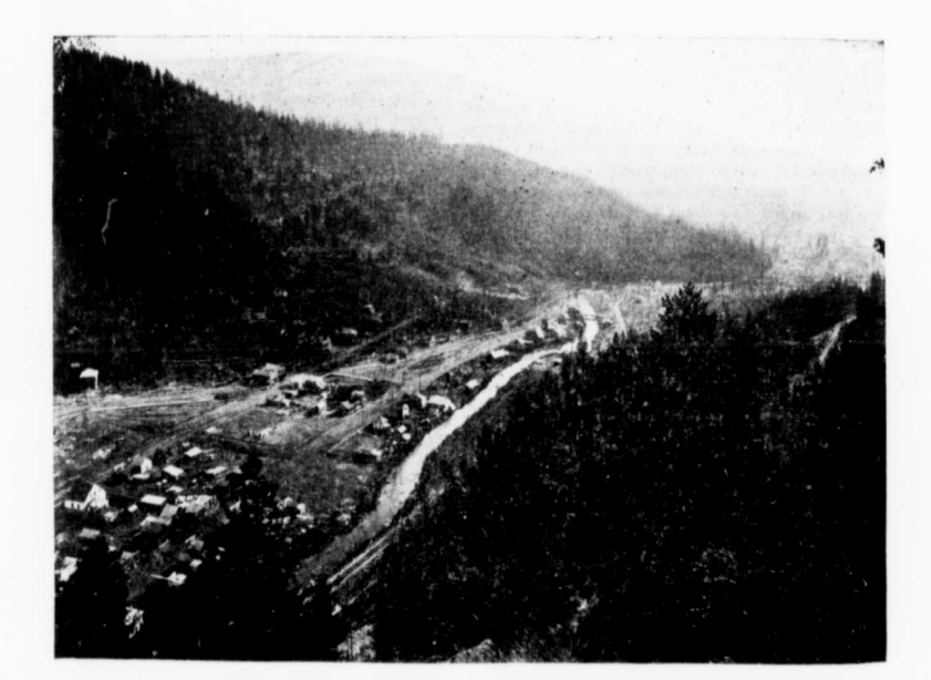
GREENWOOD, B. C., LOOKING TOWARD ANACONDA, The Site of New Smelter Blown in Last Month.

There are several camps on creeks running into the main Kettle river above Rock Creek, but proteically no work outside of assessments is being done in them just now. These include the Crown Point and Barrett's groups on James creek: Perkins, Douglas and Atwood's groups below West bridge and Canyon and other cree-ks above it. On the Montana, Colorado and Fourth of July claims on Canyon creek good showings of copper-gold ore are to be found, with fair assay values. Some $2,000 have been spent here on development work. On the Silver Dollar and Barnato claims on Horshoe Mountain there are large bodies of quartz and arsenical iron carrying gold. The O. K, and Fletcher's groups have harge iron cushowings with streaks of high grade quartz and traces of tellaride. A lot of surface work has been done on the Mozul.