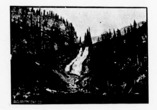
SEVEN-MILE WATERFALL, TROUT LAKE DISTRICT.