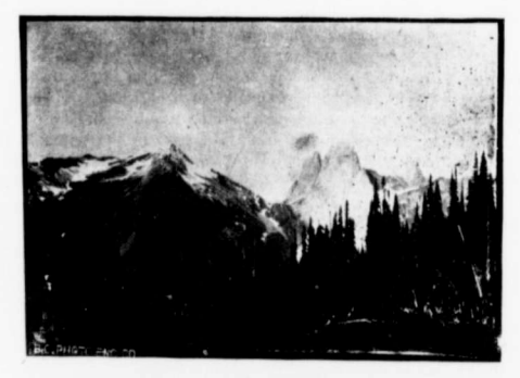
PEAKS ABOVE THE LADE & BRADSHOT CLAIMS.

On the north fork of the Lardo prospecting has not been so vigorous as on the south fork; although capital has recently been interested in two properties which appear to have good