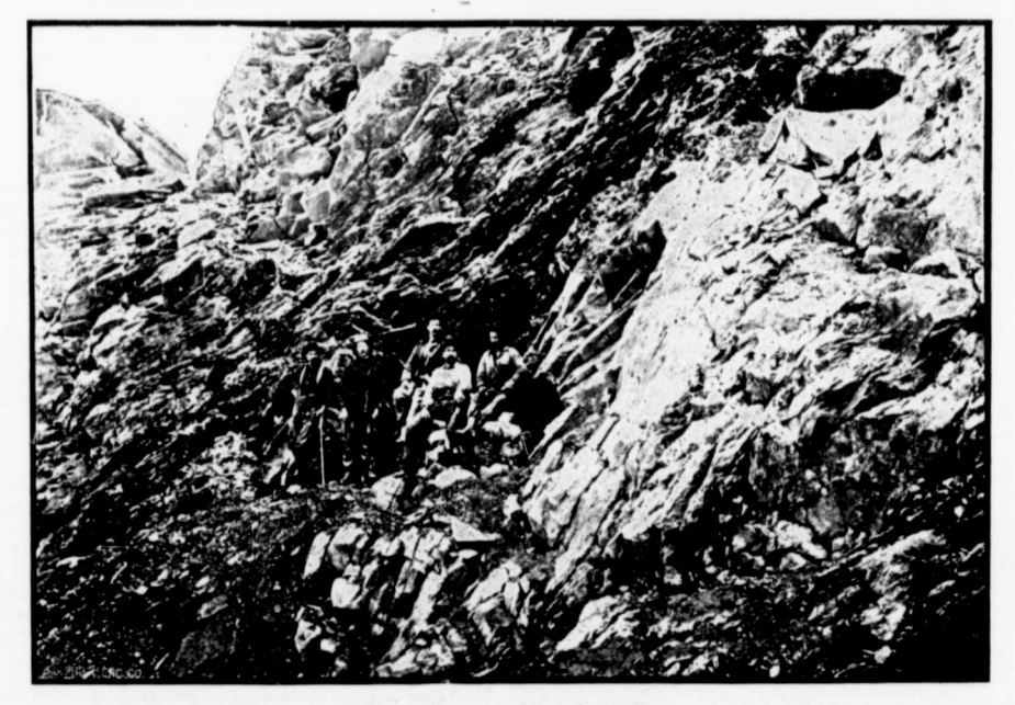
A SURFACE SHOWING OF ORE ON TRIUNE MINE.

prospects as the ore is high grade and in a good body. On the Duncan Slope so far as railway transportation is concerned, the district is much the same position as that round Ferguson. A good trail, however has now been carried up the river, and work on properties there has been vigorousiy pushed, and in the opinion of many, construction of a railway up the Duncan will not be long delayed. The properties depending on transportation by the Duncan, are low grade as compared with those surrounding Ferguson; but the ore bodies are much larger and with capital sufficient to develop and prove them