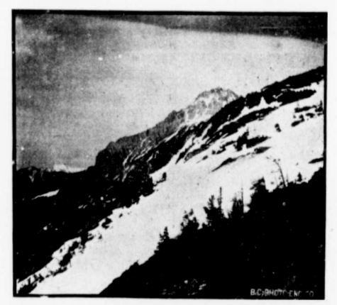
EMPIRE MOUNTAIN, SHOWING CABINS AND CLAIMS IN FOREGROUND, TROUT LAKE DISTRICT.