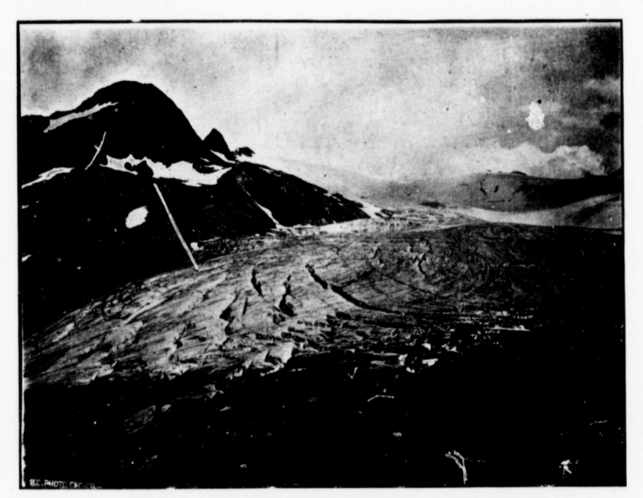
EMPIRE GLACIER, TROUT LAKE DISTRICT.

country as a whole is one of the largest mining sections in the silver lead belt of British Columbia; it has been and still is one of the least accessible. The mountain ranges are very lofty very rugged and very difficult to conquer by either trails, roads or railways. In spite, however, of the great difficulties under which the district has laboured, progress has been continuous and under the impetus of railway building, 1901 is likely to mark an epoch in the district's history, and place it in the posi-