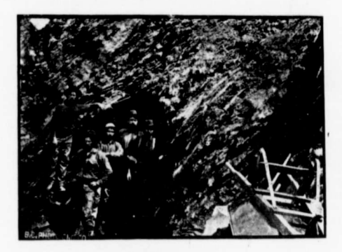
THE TRIUNE TUNNEL.

well, which was staked a year ago. It is situated in the same mineral belt as the Silver Cup, and Triune, but differs from them in that it is a high grade gold proposition. The ledge lies in slate. The ore buyer from the Trail smelter took seven average samples from the outcrop for a smelter test, and these averaged $213.60 in gold, silver $15.56 or $229.16 to the ton. From picked samples, however, as high as $800 have been obtained. Owing to the early fall of snow the owners were unable (working in an open cut on the surface) to take out more than a 7 ton shipment, which netted them $150 to the ton.