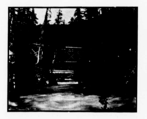
THE "BRIDGE OF SIGHS," NEAR FERGUSON.

Next in importance to the above must be ranked the Crom-