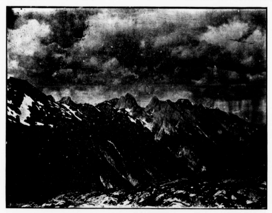
IN THE HEART OF THE SELKIRKS.

make a twenty ton shipment to the Trail smeller, which after paying $47 per ton for freight charges and treatment netted them the handsome returns of $268.84 to the ton. The values in the 20 tons were, gold $237.58, silver $4,985.95, lead $589.96. Picked samples from some of the rich carbonates ran $13 in gold, 3951_A' oz. silver, 58 per cent. lead. The lessees before quitting work for the winter had in a little over four months taken