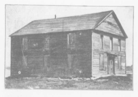
HAY BAY CHURCH The First Methodist Church in Upper Canada.