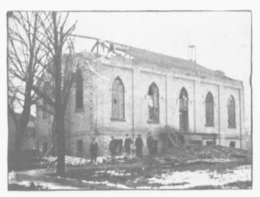
WESLEYAN METHODIST CHURCH

inches from the plate level to the pitch of the roof. A tower to be built in the centre of the front end, twelve feet square outside measure, projecting five feet and a half outside the front