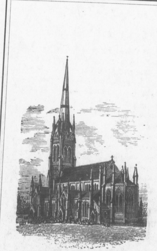
ST. JAMES' CATHEDRAL, TORONTO.