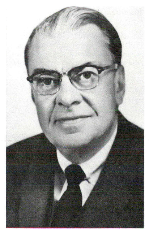
Senator Paul Martin, recently appointed Canadian High Commissioner in London, was a former Secretary of State for External Affairs.

Mr. Martin served as a Cabinet minister for 23 years, under four prime ministers. He was Minister of National Health and Welfare from 1946 to 1957, Secretary of State for External Affairs from 1963 to 1968, and more recently Leader of the Government in the Senate.