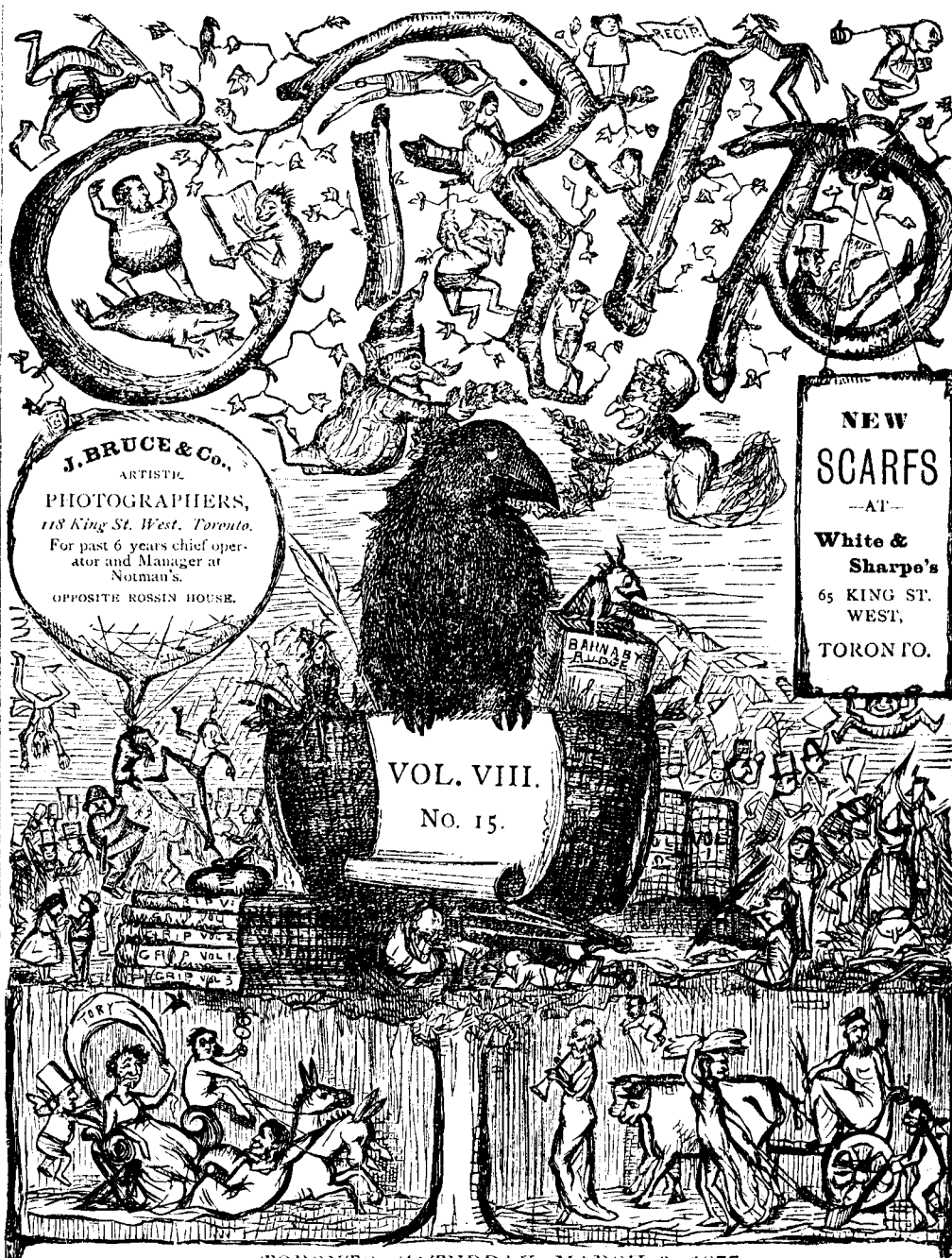
TORONTO, SATURDAY, MARCH 3, 1877.

LUNCH SERVED. TEA, COFFEE AND MEATS AT ALL HOURS.