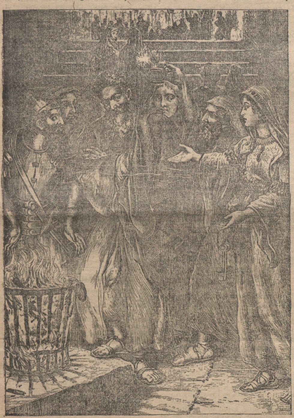
PETER SAYS HE NEVER KNEW JESUS.

Now Peter was more frightened than ever,