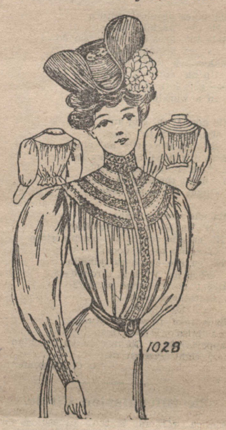
NO. 1028.—LADIES' TUCKED OR GATHERED SHIRT WAIST.

A design is shown in this pretty waist which is not difficult to make up at home. It would make up nicely in any of the light materials trimmed with lace insertion, and has a bishop or sailor sleeve, flare cuffs being optional. It requires 334 yards of material 27 inches wide, or 2 7-8 yards 36 inches wide, with 4 yards of insertion.