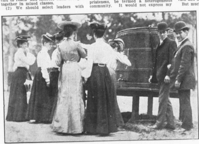
DRINKING TENT, OUTSIDE "TENT ONTARIO.

a great movement in politia great movement in political circles, in social affairs, or in spiritual life that the methods adopted have not ignored all precedent abooked the conventional sense of propriety. It was a wide departure from constitutional methods of precedure that Oliver Cromwell was guilty of when followed by a company of musketeers he marched down to the House of Commons and summarily dismissed the assembly and practically took