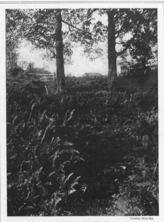
A FIELD OF FERNS