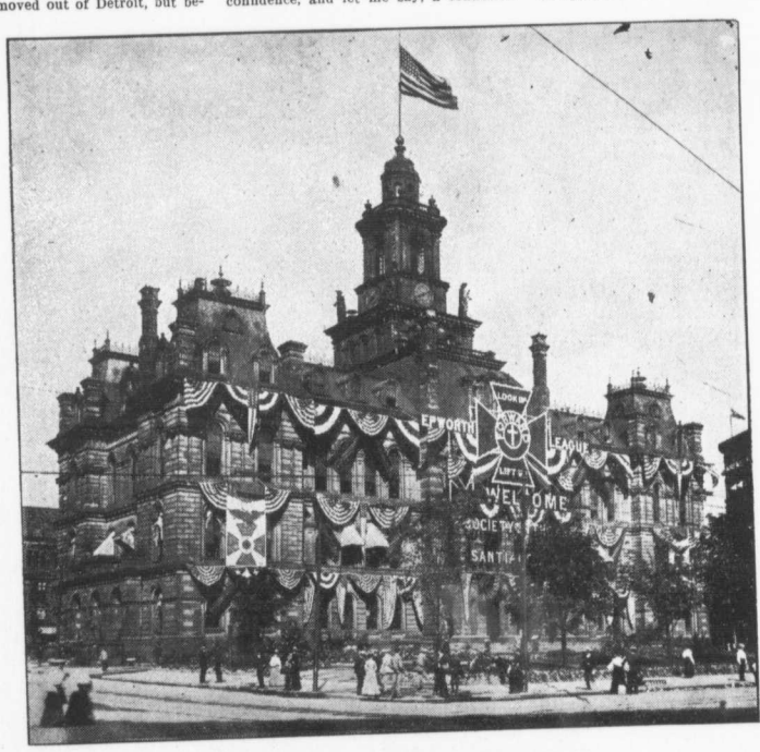
THE CITY HALL, DETROIT, DECORATED FOR THE CONVENTION.

who have looked upon Canada as a mere fringe of settlements along the international boundary, with the Polar regions for a background, will hardly expect to see the fulfilment of my prediction, but when you realize, difficult though it may be to do so, that Canada, including Newfoundland—and before many years Newfoundland will undoubtedly be part of our Confederation—is a little larger than the United States, and that at the present time we are growing No. 1 hard wheat almost seven hundred miles north of the international boundary, and you will appreciate the extent and richness of the territory to be settled, and you will not have such grave doubts about our future. In fact, for your comfort, let me assure you, that if when you grow old you require that the Monroe doctrine should explied on your behalf, we shall be