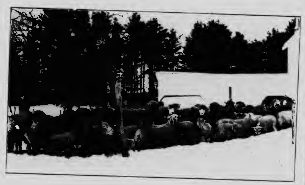
Spring lamb in the making.

Castration should also be done at the time of doeking. It may be performed by cutting off with a knife the bottom of the serotum, seizing the end of the testieles, after slitting the covering membrane, with pincers and drawing them and the cords