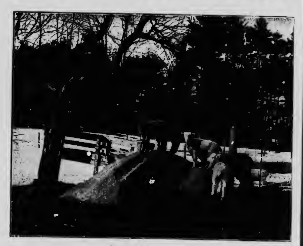
Monarchs of all they survey.

Care of lambs should begin before they are orn. The ewes, during the breeding season, thould be placed upon as good pasture as ean be afforded and, if necessary, some supplementary soiling fodder be provided. When they are brought into winter querters, the should be changed gradually from pasture conditions to dry rations, and throughout the winter some feed of a succellent nature should always be supplied them. Roots and silage can be given to excellent purpose in this regard. Neither, however, should be fed extravagantly, for over-feeding is prone to cause the production of flabby, goitered lambs and sometimes abortion. Silage may be given at the