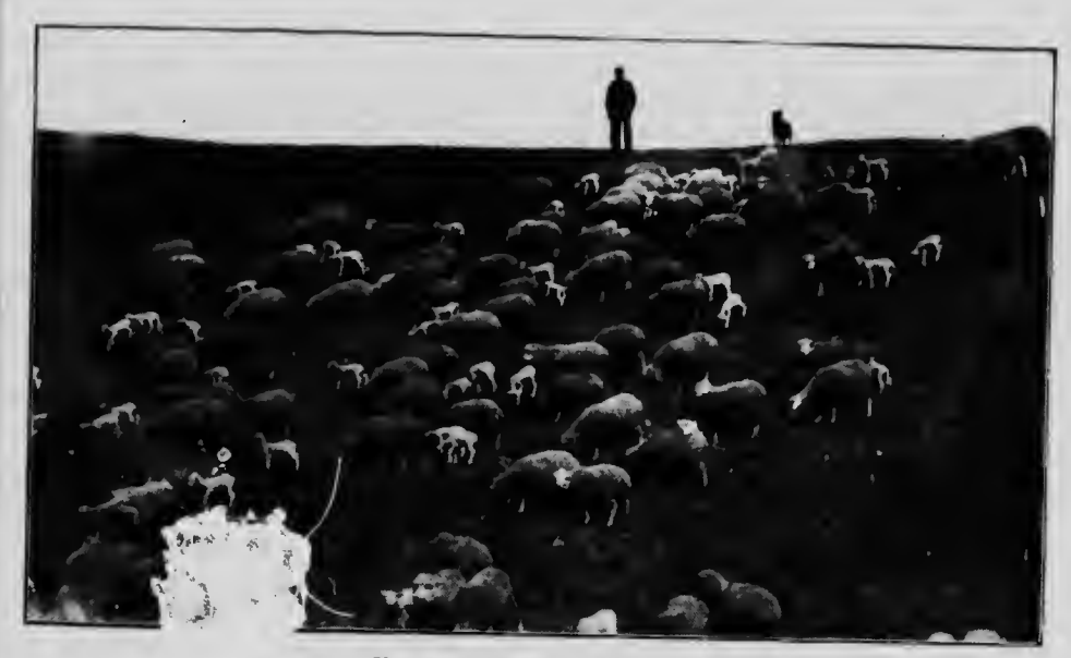
Ewes and lambs on the Range.

Normal presentation of the lamb in the womb is head and fore feet first, the head lying upon the feet. Under normal conditions the ewe can virtually always relieve herself of the lamb without assistance. Should the lamb be very large, or lying in any position than the natural one, it may be necessary to aid the ewe, but no attempt should be made unless she is totally unable to year herself and shows evident signs of exhaustion. In aiding parturition great eare should be taken to elip the finger nails short so that they will not tear the tender tissue of the vaginal passage or of the womb. It is also a good plan to grease the arm with vaseline. Place the ewe on her side upon the ground, and thrust the arm gently up the vagina. If the presentation is normal, grasp the fore legs and pull gently while the ewe strains. Never use undue force. If the lamb does not lie in the natural position, it must be turned