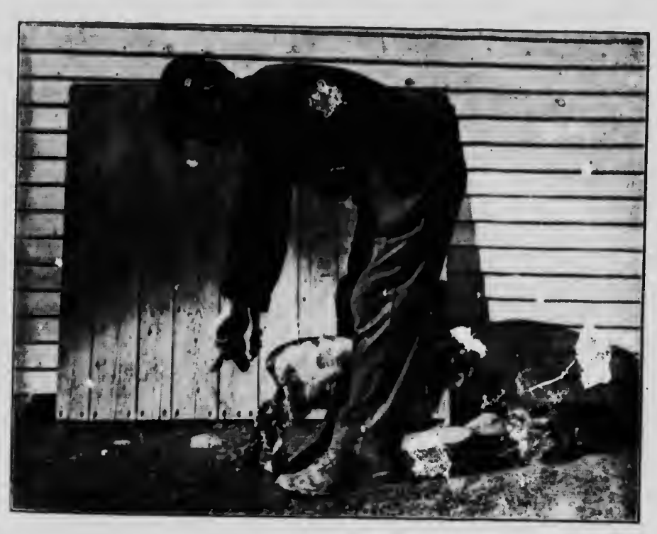
Docking the land-The tail severed.

Docking should be done when the lambs are about ten days ld. The easiest method is to place the lamb between the operator's legs, its rear e in front of him.