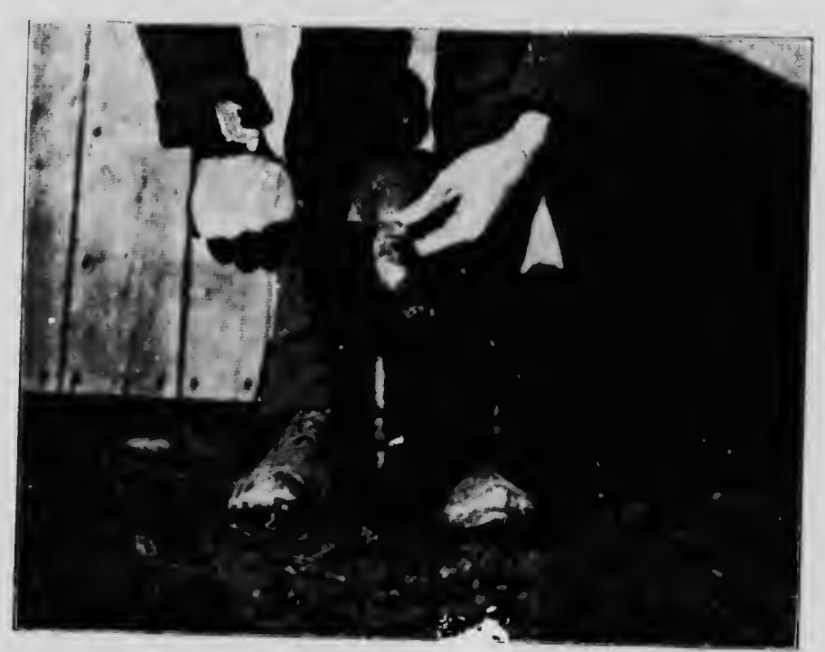
Docking the lamb -Correct position.

Lambs should be taught to cut as soon us possible after birth. Even when a few days old they will commence nibbling, and when they are two weeks of age should be