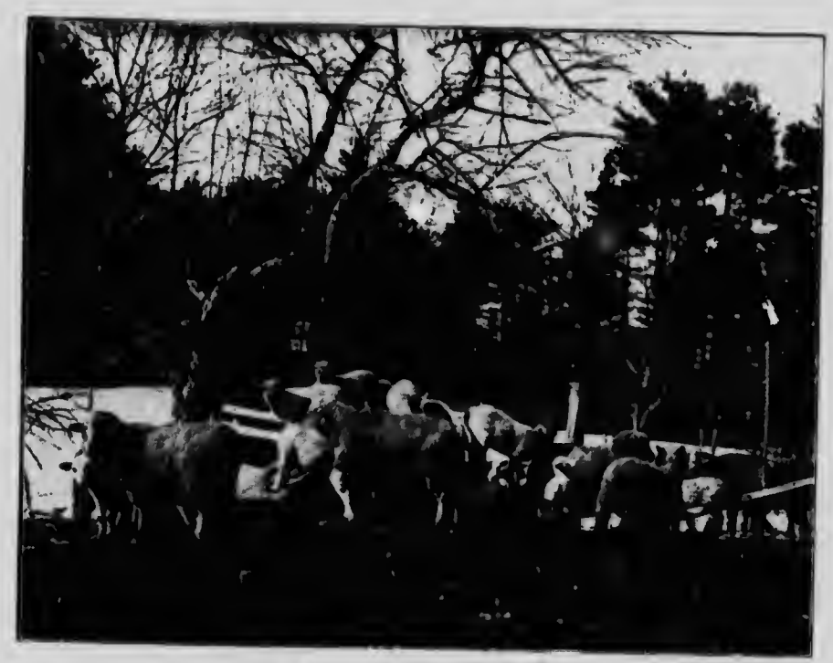
Ewes and lambs on an Eastern farm.

The first action of the natural dam, after parturition, is to lick the lamb. The licking dries it and helps to start the blood into rapid circulation. Besides, the ewe gets the odor of the lamb, by which she subsequently recognizes her offspring.