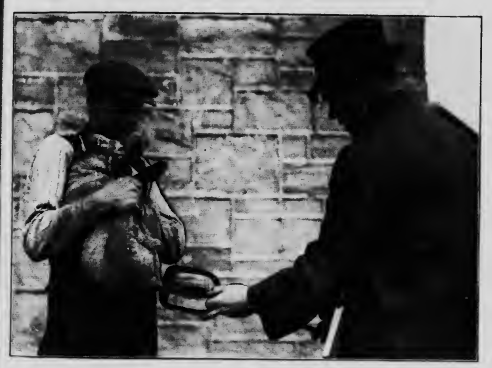
Method of docking lambs with pincers.

All ram lambs not intended for breeding purposes should be unsexed. Wethers will make greater growth and fatten more readily, and the flesh is of a more delicate