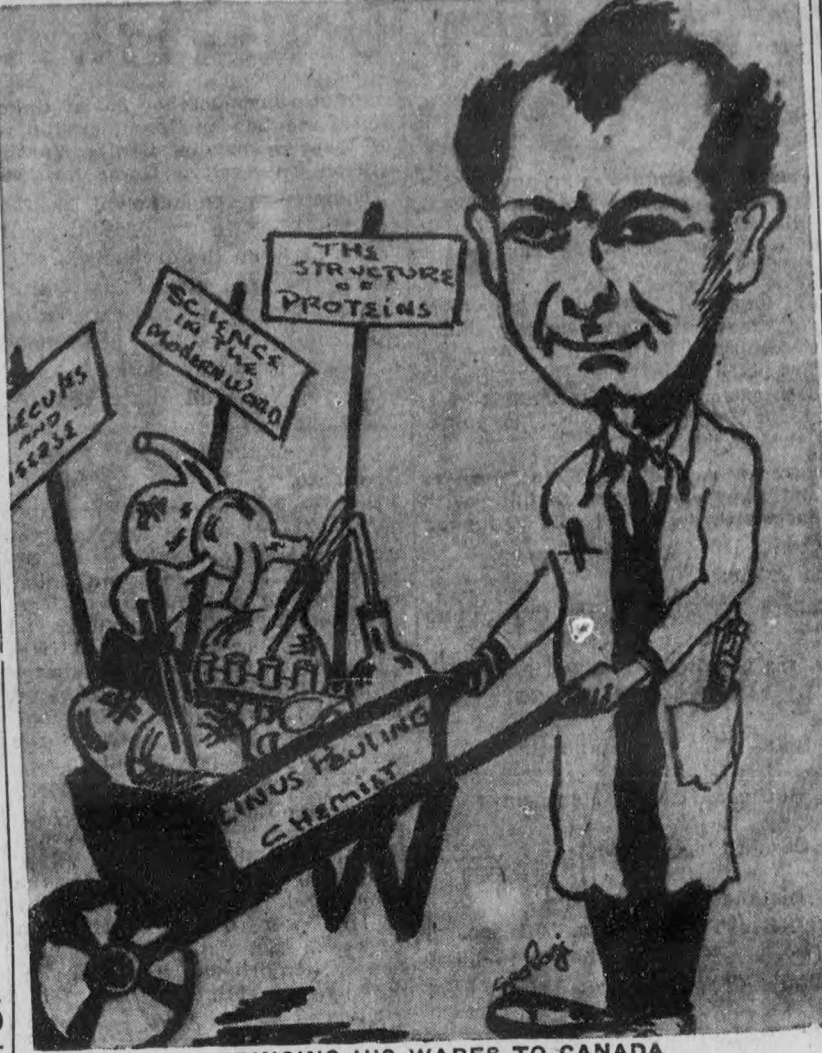
BRINGING HIS WARES TO CANADA