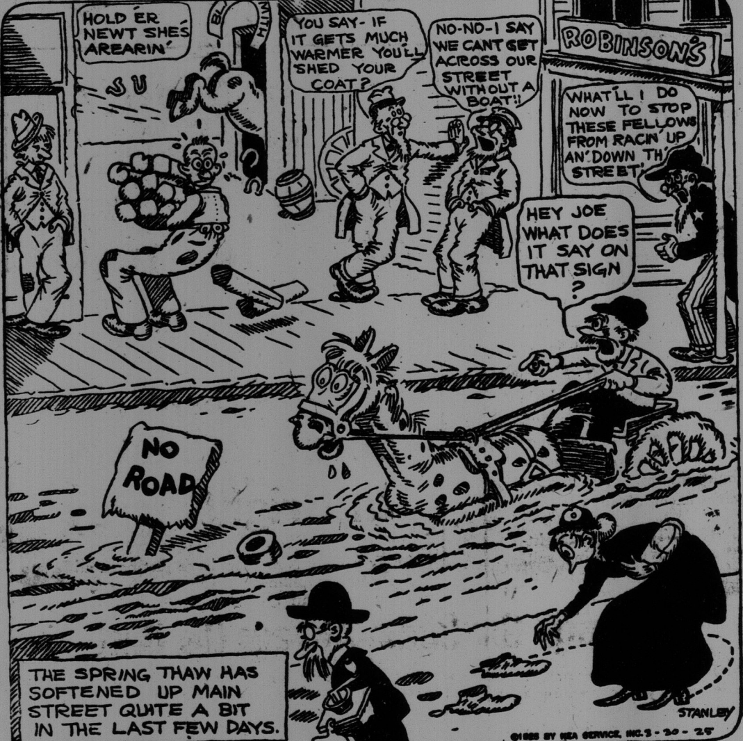
THE SPRING THAW HAS SOFTENED UP MAIN STREET QUITE A BIT IN THE LAST FEW DAYS.