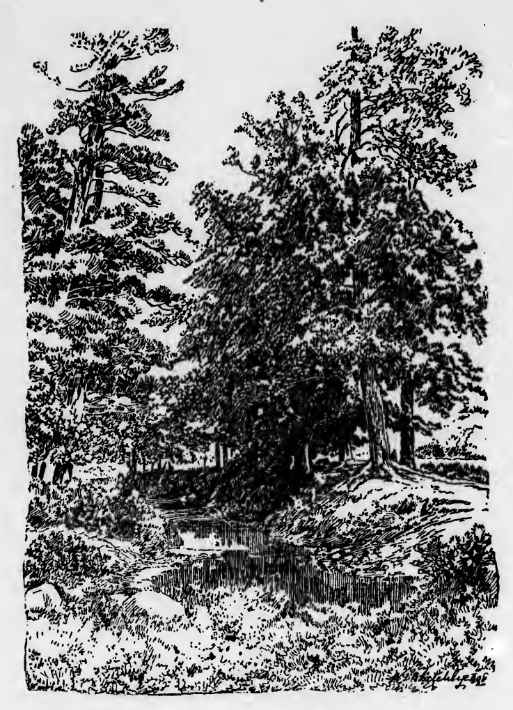
No. 128.-A Quiet Pool.-W. D. Blatchly.