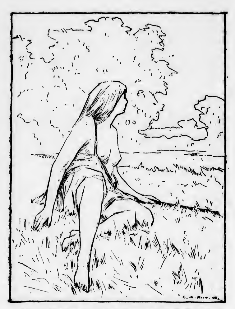
No. 1.—The Hvening Star.—George A. Reid, R.O.A.