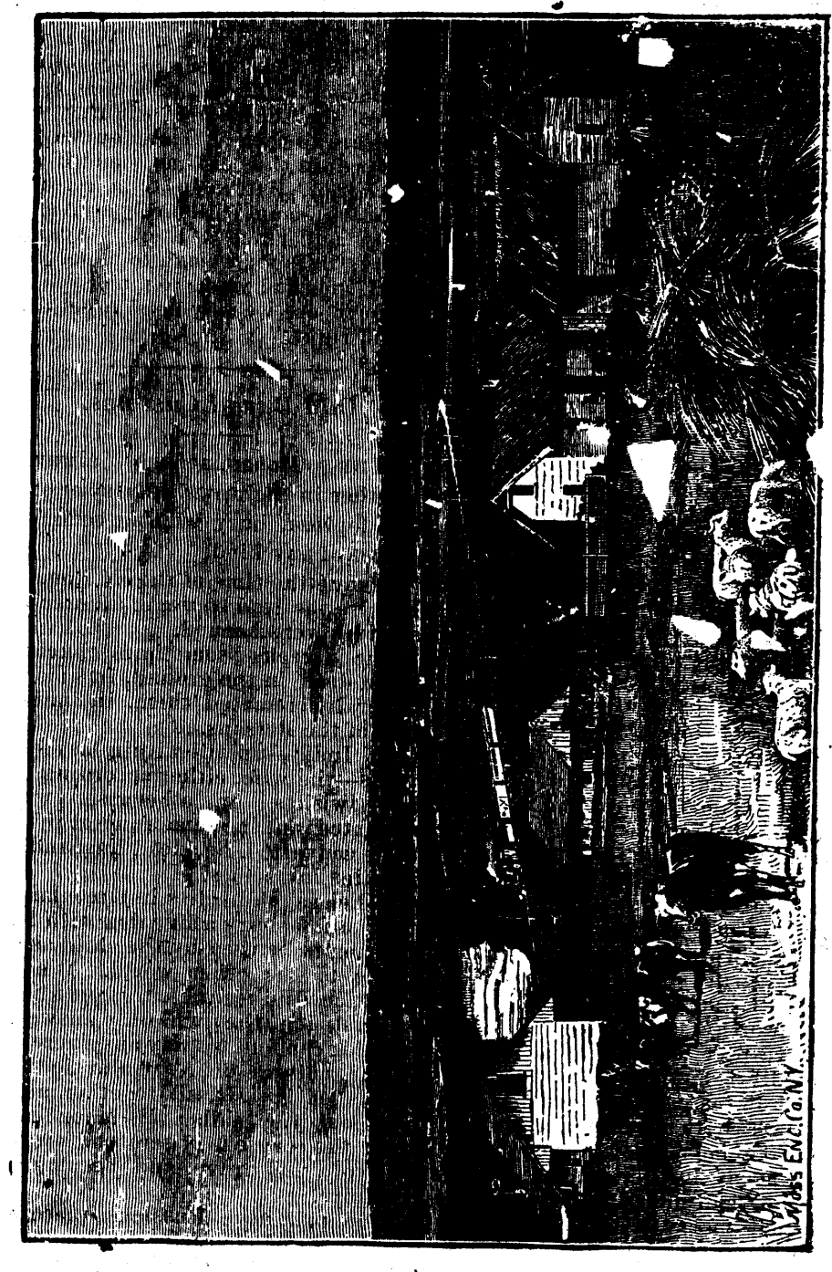
FARM NEAR RAPID CITY ON THE LINE OF M, & N, W, R,