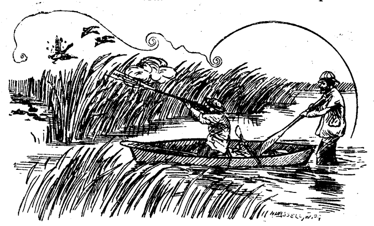
RUNNING THE SHALLOWS.

of landing, and the toe the isthmus. Yes, that would be a splendid trip; ducks were reported plentiful; the weather was all that could be desired; mosquitoes were about all gone, and every thing sounded lovely. Making a portage was easy work, (in our minds). All we had to do, was carry the boat across that narrow strip of land, and as it weighed only seventy-five pounds at that time, that was nothing for two strong men. On the day set, off we started, having secured a lad to look after the team, reached the slough, stabled the horses, and got afloat. I must tell you about the boat. My partner in this trip, and myself, were the architects and builders. She-I speak of her in