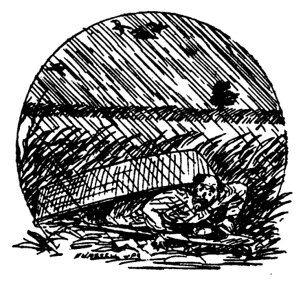
A SLIGHT MISHAP.

eminence near from which to get our bearings, and fird the exact location of the creek. We were surrounded by hundreds of acres of tall reeds, and they were too thick to see through, so my partner humped his back leap-frog fastion, and I climbed up on it. This partner is somewhat a joker; partly because he is, and partly because as he says, he was a little week in the knees, or I was too heavy, his knees suddenly flapped forward; I wasn't looking for anything like this; I was looking for the creek, so over I went. sprawling among the reeds. After digging the mud out of my nose, I