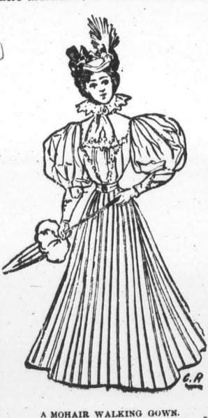
A MOHAIR WALKING GOWN.

A Dream in Mohair. The light gray-blue mohair gown, here illustrated, is made with a plain