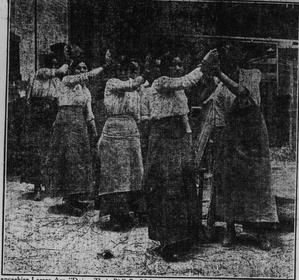
Lancashire Lasses Are "Doing Their Bit" By Making Glass When the Men are Away Fighting. THE lasses of Lancashire are now assisting in the making of glass at St. Helens, and do all kinds of labor, even to working the overhead cranes. There are many secrets in the trade, and before the war the Belgians were the chief producers. The photo shows some girls carrying a huge sheet of glass. They have adapted themselves to the various

If you would have your summer supmore. Pour them into a clean, dry jar ply of white silk stockings remain Pickled Walnuts (Another Recipe). dried in the shade and washed in luke-