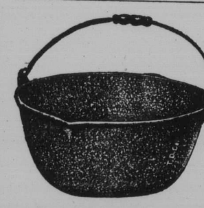
Preserving Kettles We have a big variety of sizes and prices.

Forks, Rakes, Hoes. Scythes, Swaths, etc -Are the Best on the Mar-