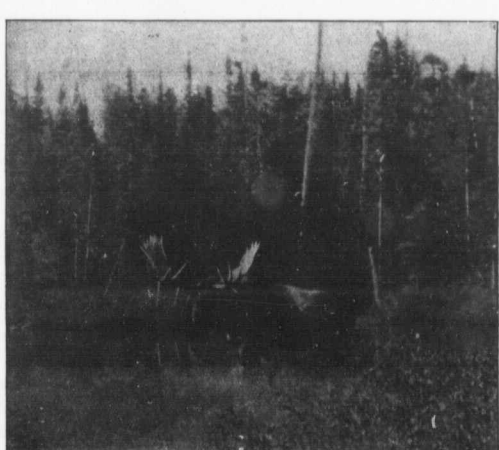
THE MONARCH OF THE NEW BRUNSWICK WOODS On the Intercolonial Railway.

"Blessed be the man that really loves flowers!—loves them for their own sakes, for their beauty, their associations, the joy they have given and always will give; so that he would sit down among them as friends and con panions, if