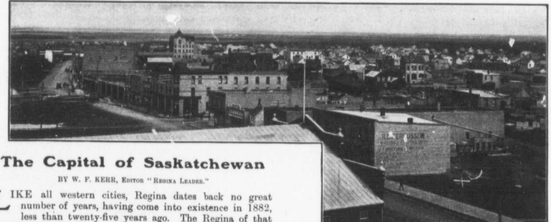
GENERAL VIEW OF REGINA

less than twenty-five years ago. The Regina of that period was a city of tents, very different from the prosperous, substantial business centre that it is to-day.