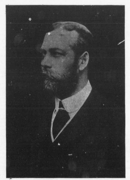
H. R. H. THE PRINCE OF WALES