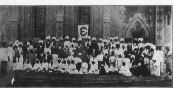
THE PUNJAB CHRISTIAN ENDEAVOR CONVENTION OF 1905

One of the besetting snares of these times is to try to grow rich rapidly. "Slow and sure" are out of fashion. In that direction lies peril to the soul. They who make haste to be rich fall into temptations and snares and many hurtful lusts that drown men in perdition! Greed for gold drains away the sweetest and holiest affections of the heart; it dries up Christian benevolence: it robs God of his due. My long observation has been that when money flows in rapidly, grace is apt to flow out; and as a Christian mounts up as to his income, he rarely rises in piety with it. There are some happy exceptions, but they are the men who keep a checkrein on the grasping, greedy spirit of covetousness. My good brother, it is no easy thing to keep up a high tone of spiritual life amid all the atmospheric pressures that surround you; to do it you have got to take time to eat and to think and to