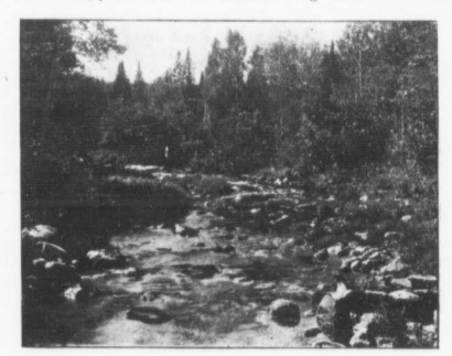
A TROUT CREEK NEAR NEWCASTLE, N.B. On the Intercolonial Railway.

"I'll prove that you can get the walk and the sociability too. First, you'll meet the man moving the lawn on the