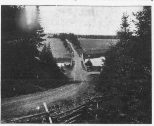
A COUNTRY DRIVE, P.E.I. On the Intercolonial Railway.