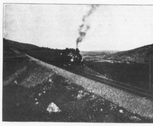
MARITIME EXPRESS—RUNNING IN VIEW WENTWORTH VALLEY On the Intercolonial Railway.

Few persons realize how much of their happiness, such as it is, is dependent upon their work, upon the fact that they are kept busy and not left to feed upon themselves. Happiness comes most to persons who seek her least and think least about her. It is not an object to be sought; it is a statement to be induced. It must follow and not lead. It