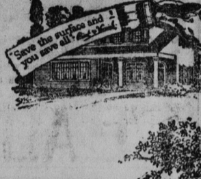
Yes, that house has been in the family for 50 years.