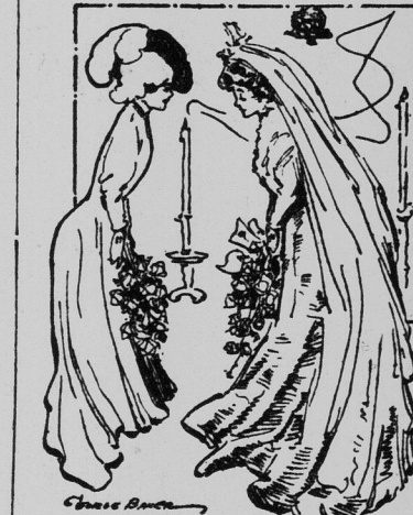
STILL SHE WAS GLAD TO GET THEM. Bridesmaid (after the ceremony)— Weren't you frightened nearly to death? Bride—Frightened Why, I could hard-