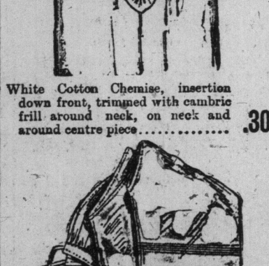
White Cotton Chemise, insertion down front, trimmed with cambric frill around neck, on neck and around centre pieces..... 30