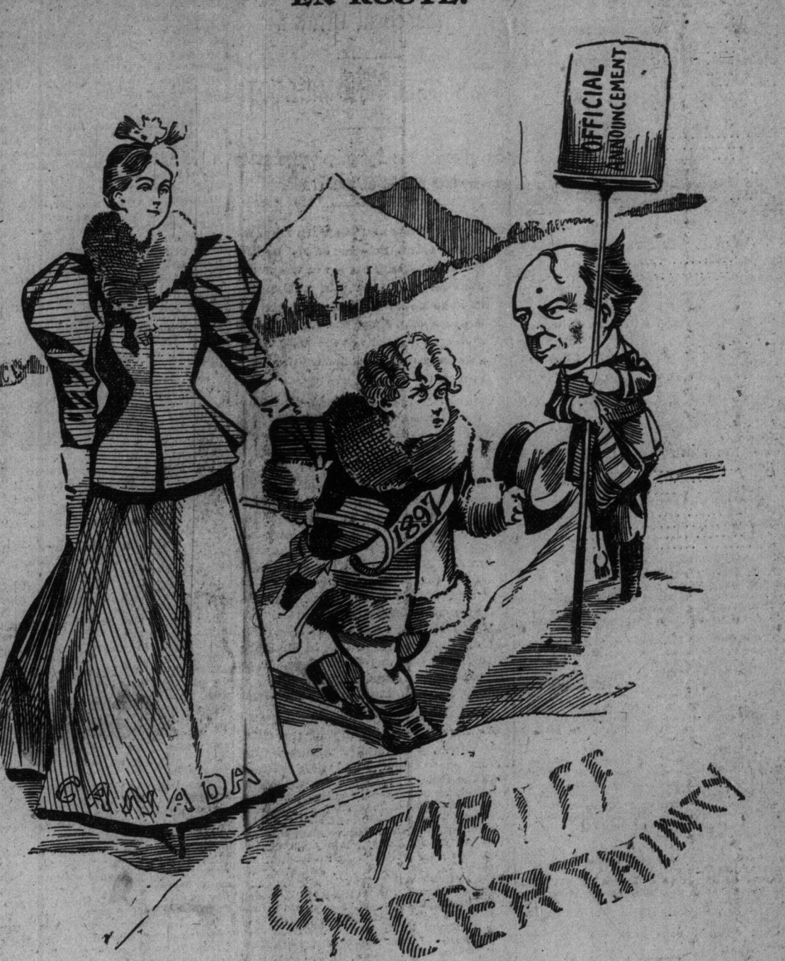
THE YOUNG MAN. Now, then, young man, do a little hustling and clear us a pathway. I am about to escort this lady to GOOD TIMES.

They also pointed out that the maps of the Province of Ontario, which have been made for the purpose of the Geological Survey, are not up to date, and that the maps should be revised.