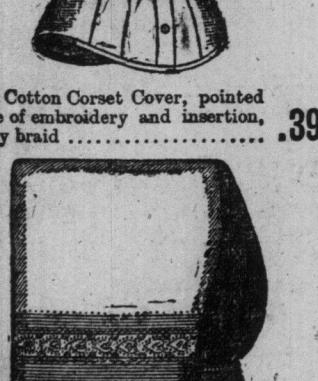
White Cotton Corset, pointed yoke of embroidery and insertion, fancy braid..... 39