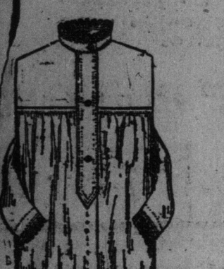
White Cotton Night Gown, with collar finished with full of embroidery, yoke, lace on neck and sleeves, same as cut..... 29

Above everything else we insist that you make comparisons. These plain, definite statements give you a good chance to compare.