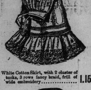
White Cotton Skirt, with 2 clusters of tucks, 3 rows fancy braid, frill of wide embroidery..... 1.16