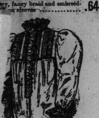
White Cotton Gown, Mother Hubbard yoke, 4 clusters of tucks, 2 rows of insertion, sailor collar finished with full of embroidery, yoke, lace on neck and sleeves, fancy braid..... 73