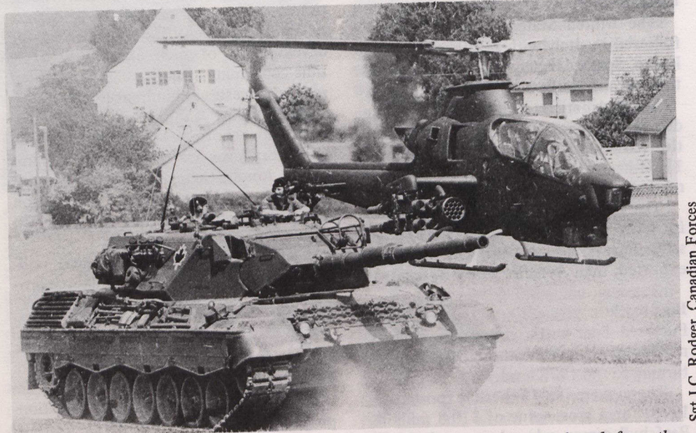
A U.S. Cobra helicopter from Ansbach, Germany, hovers over a Leopard tank from the Royal Canadian Dragoons during a recent anti-armour helicopter exercise with the Canadian Forces' 444 Tactical Helicopter Squadron in Westheim, Germany. The ten-day exercise stressed co-operation between the two NATO allies as Canadian Forces' observation helicopters searched for the "enemy" and guided the heavily armoured Cobras onto the target. The Royal Canadian Dragoons and 444 Tactical Helicopter Squadron are two units of the 4 Canadian Mechanized Brigade Group based at Lahr, Germany.