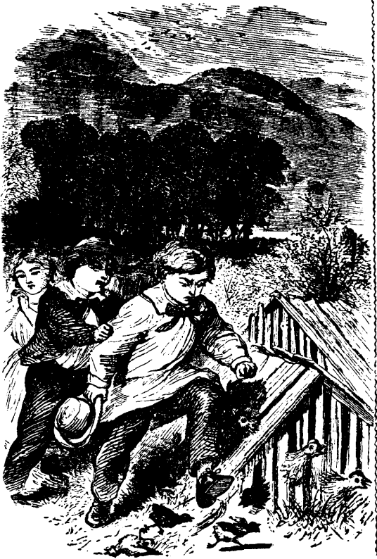
For the Sunday-School Advocate,