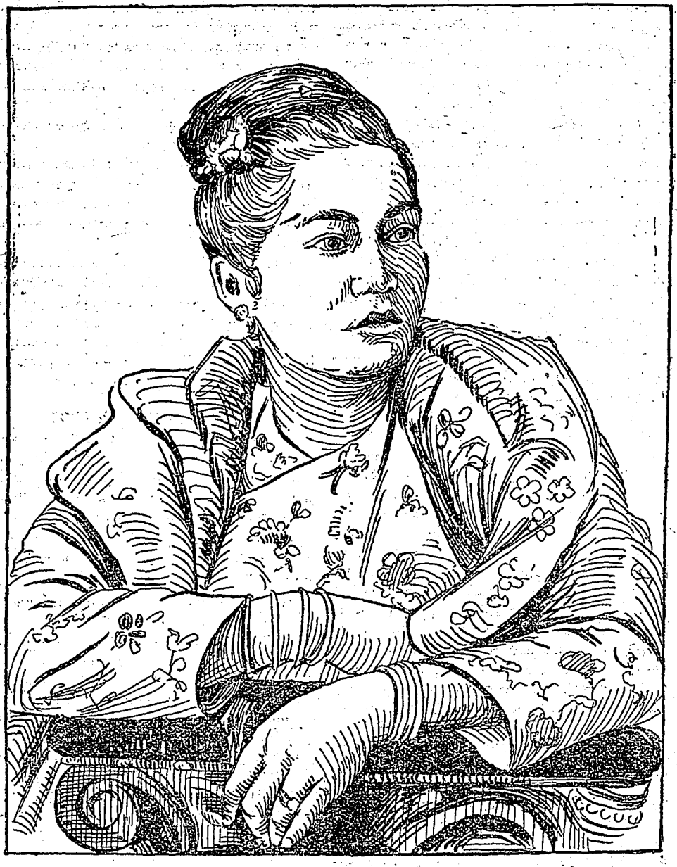
A BURMESE YOUNG WOMAN.

And when a girl is old enough to undergo the ear-boring ceremony, her parents consult an astrologer, who selects, with considerable ostentation, a favorable day and hour for the rite. . This event, which takes place when a girl is about twelve or thirteen years of age, is supposed to indicate her transition from girlhood to womanhood. The astrologer having decided upon a day which will bring every happiness to the young girl, her parents invite their friends to be present on the important occasion. It is a day of rejoicing, and a band is early in attendance. It plays energetically and unceasingly throughout the ceremony. There are two or three performers for every instrument, so that directly one tires another takes a turn at emitting the unmelodious sounds. The arrival of the professional ear-borer creates intense excitement and interest among the guests. tain formalities are gone through, and then the young woman is held down by her female relations while the operator pierces the lobes of her ears with a gold needle. The fashionable earrings, consisting generally of pieces of jadestone, are unpleasanlty large, and it is some time before the young woman succeeds in distending her ears to the required Women of the lower class, when travelling, carry spare cheroots in their ears.