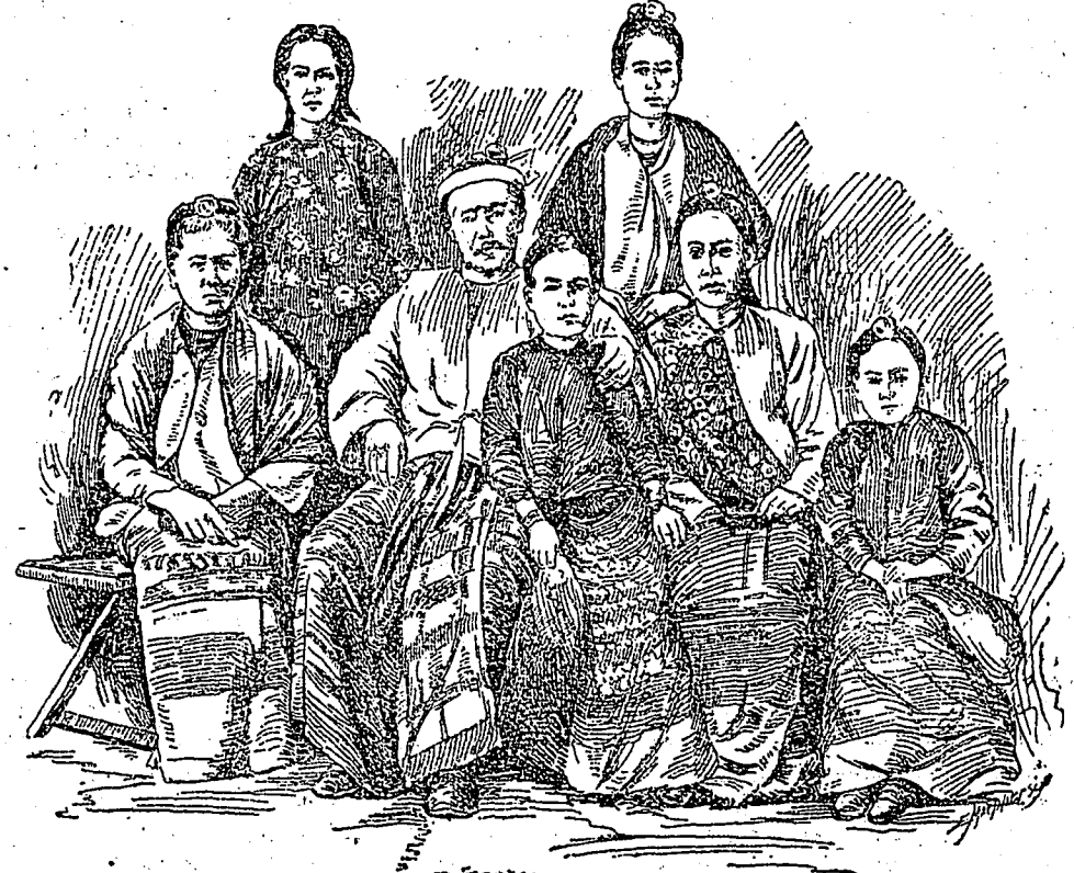
A BURMESE FAMILY-FATHER, MOTHER, AND FIVE DAUGHTERS

'Isn't he too provoking!' exclaimed Lot-