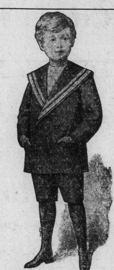
THE ARRAN SUIT.

Light weight Tweeds and all wool Serges are the latest showing for the Arran Suit. Come and see them. We will be pleased to show you all the different materials. Fit boys 5 to 10 yrs.