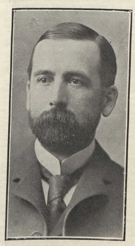
HON. GEO. H. PERLEY.

'The word "Maple" shall not be used either alone or in combination with any other word or words on the label or other mark on a package containing any article of food or any article of food itself which is or which resembles maple sugar or maple syrup, and any article of food labelled or marked in violation of this subsection shall be deemed to be adulterated within the meaning of this Act.'