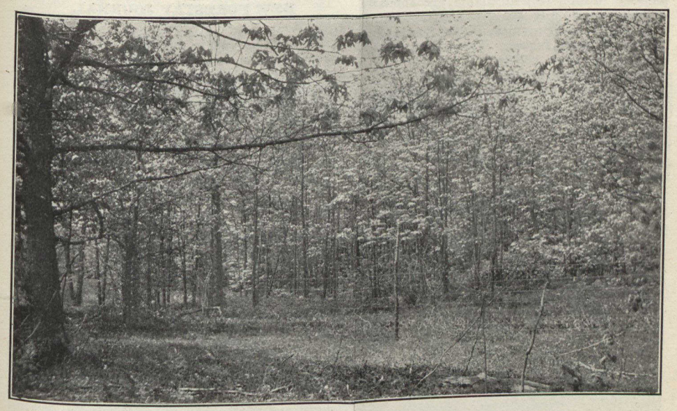
The Bad Results of Grazing.

wind. Next it takes up improvement cutting and thinning. The fullest section is that on Reproduction, which deals with natural seeding, artificial seeding, disadvantages of seeding, planting, and sprout or coppice method, and adds a table of quantities and distances to show how much seed and how many plants are required per acre when artificial reproduction is followed. Those of our members who are contemplating improving their woodlots, or who would like to place something of a brief and popular character in the hands of those who