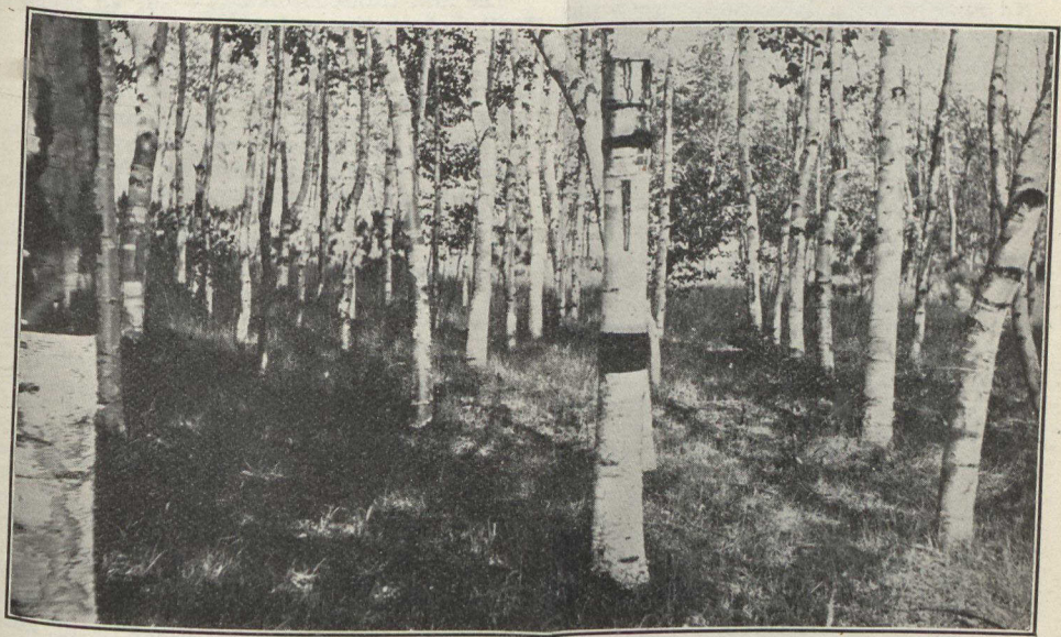
Birch Planted Too Far Apart.

The larch in this district is not a very important tree. In the forest it appears as tall, clean timber. Its product does not justify its appearance. The butt is heavy, and trees which are to be floated or driven must be long butted four to eight feet. The butt logs are usually very shaky, and when dry practically fall to