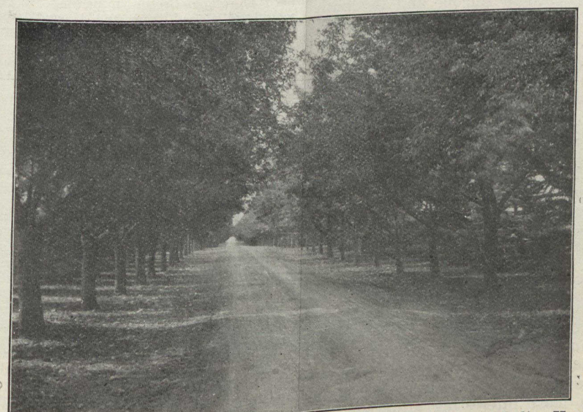
View of avenue of Manitoba Maples at Dominion Experimental Farm at Indian Head, Saskatchewan. When these trees were planted scarcely anybody believed that trees could be got to grow between Manitoba and the Rocky Mountains. Now over twenty million trees sent out from the Dominion Forestry Branch Nursery at Indian Head are growing about prairie homesteads.

sales of timber from the hills. This was a particularly satisfactory arrangement to them because the work in the woods came in the winter, when there was little work to do on their farms. In some respects it is a good way of handling timber. The difficulty is that the cutting has been carried on without regard to the principles of reproduction, and now that the farmers are getting toward the end of their timber they realize that they must either change their methods or suffer a serious decrease in income. This is all the more exasperating as they realize that they could secure