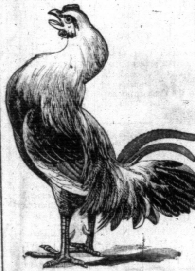
G. N. W. Bulletin. London, June 5—It is officially announced that the British have occupied Pretoria.

The City Taken Without Firing a Shot—President Kruger a Fugitive—The War Virtually Over Transvaal's Foreign Troops Turned Adrift Without Pay.