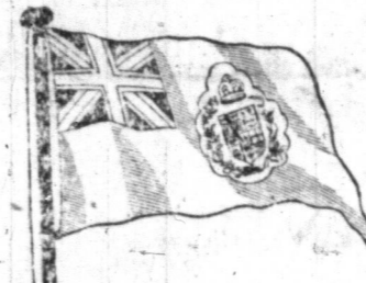
Honor of Gloria, Vivat Victoria, We have Pretoria, God Save the Queen.

The Lorenzo Marquez correspondent of the Times telegraphing June 4, says:—"Lorenzo Marquez is swarming with foreigners who have been assisting the Boers up to a few days ago."