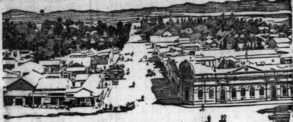
PRETORIA NOW OCCUPIED BY THE BRITISH.