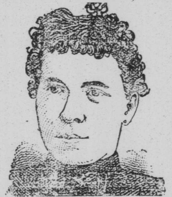
Weak and Nervous

Before a packer can engage in the lobster business he has to take out a license for his boat. This is not a fair way of taxing and the tax, like the oyster tax, is unjust and oppressive, taxing people who take thousands of dollars in a very uncertain business and which gives employment in our Parish to hundreds of people, men, women, and children.