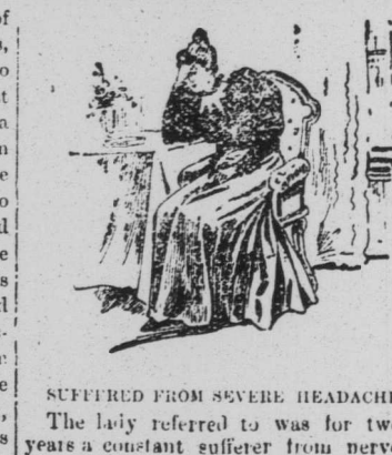
Weak and Nervous