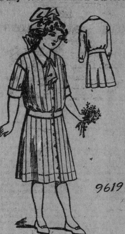
A Popular and Practical Model—Girl's Dress With Long or Shorter Sleeve.

The front closing and simple lines of this design will recommend it at once to the home dressmaker. It is suitable for serge, cashmere, linen, corduroy, line, chambray, gingham, percale or galates. As here shown blue and white striped gingham, with white trimming, was used.