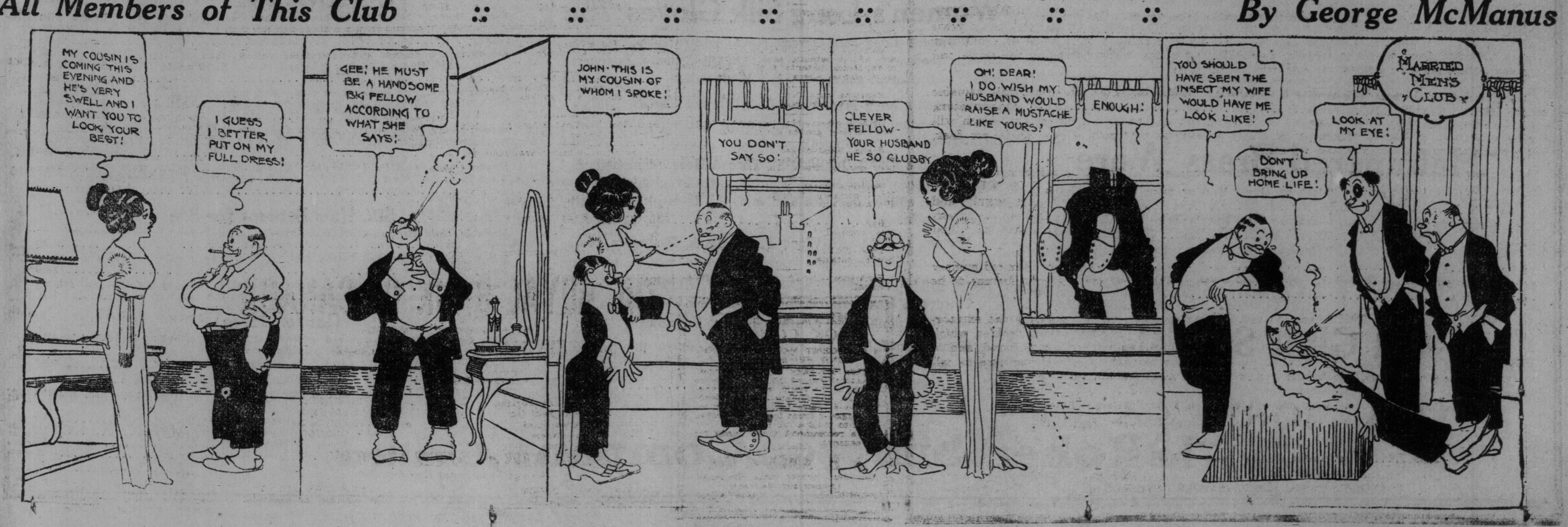
All Members of This Club :: :: :: :: :: :: By George McManus

Application for Shares in AMALGAMATED MOVING PICTURE SHOWS, LIMITED 58 Colborne Street, Toronto, Ontario