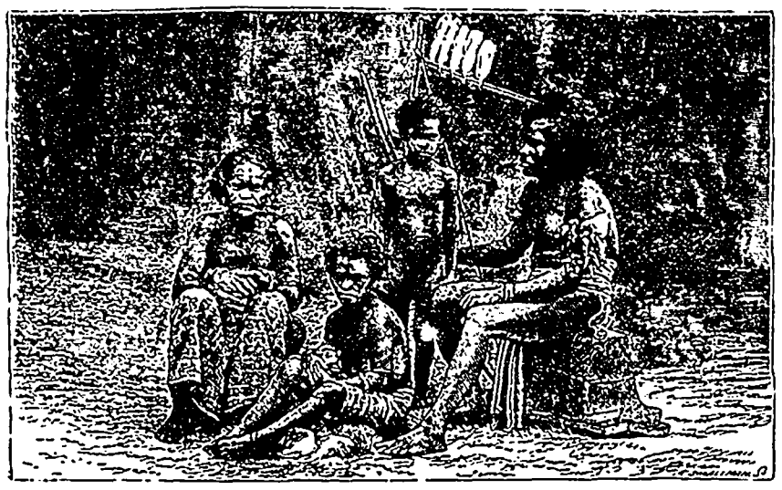
NATIVES OF NEW GUINEA.