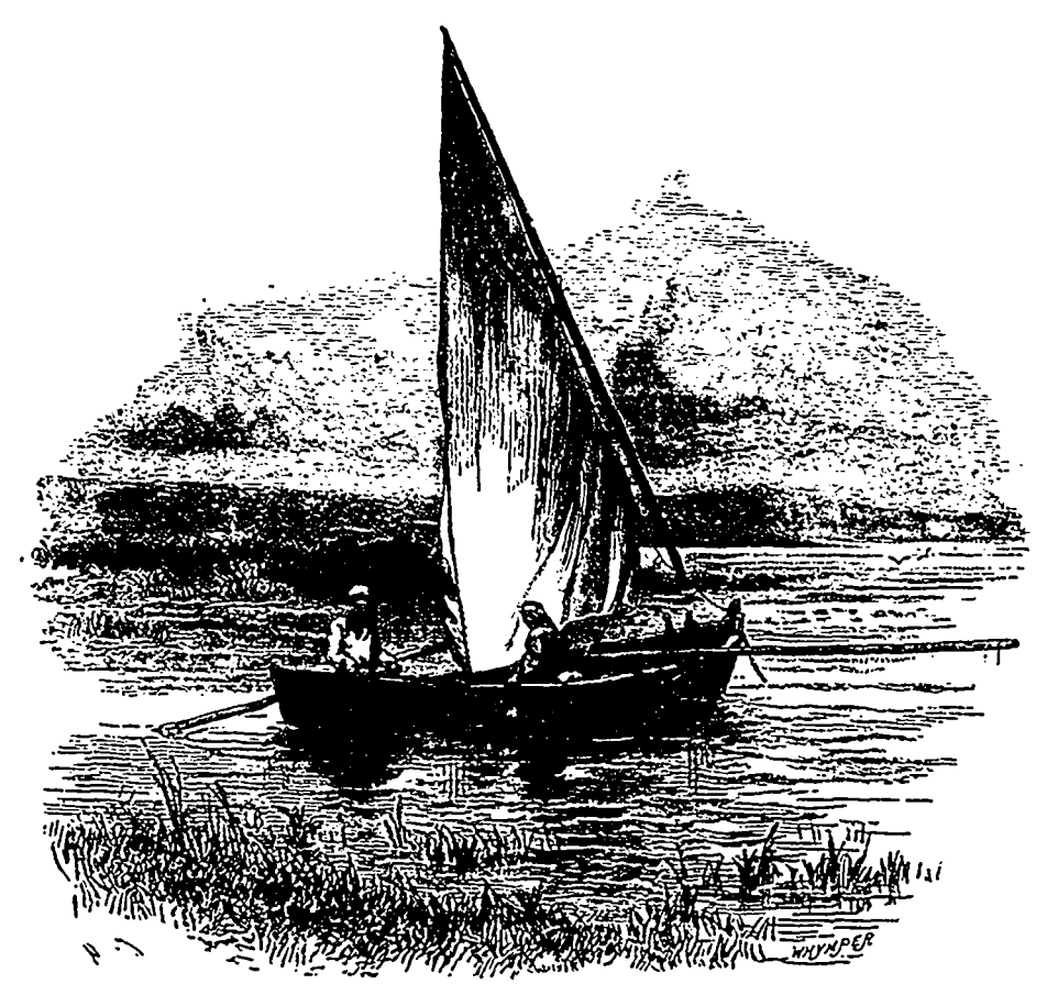
ON THE SEA OF GALILEE.