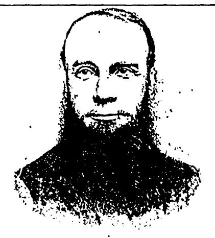
THE LATE BISHOP STEERE.

need of inward strengthening and comfort-No man in the whole world has less of it." "When we survey the two pictures," writes Archdeacon Maples, "that of the African native as it is ere Christianity has touched it, that of the same native when Christianity has embraced and reformed it, then we realize in very truth that Christ, through the Holy Spirit, still works His miracles, for we see certain and sure signs that simply the grace of God has done and is doing for Africans what centuries of secular education and civilization would be powerless to effect. And a miracle it is, for water was not more surely changed into wine at His word than by the same transforming word, new hearts and new lives have been given to scores of these African lads whom God has sent to Kiungani." Of the five slave boys given by the Sultan to the bishop, one only died unbaptized, one is a native deacon, one died as a subdeacon, one is a regular overseer, and the fifth occupies the responsible post of mission traveller. It is also interesting to note that in August, 1861, Bishop Mackenzie took charge of a little waif and carried her to camp on his shoulder. She was one of those taken to Cape Town when the mission moved to Zanzibar, and at a meeting held at Cape Town three years ago she was present, and offered a pound towards the work.