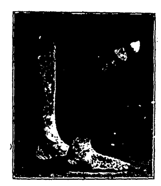
Fig. 6, Case 5.

occupied in fully correcting the varus, a much longer time than in any other case. A few days ago the tendo-Achillis was cut, and the feet brought to an angle of 100 degrees with the leg. Still under treatment.