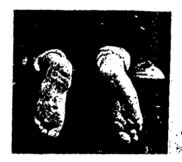
Fig. 1, Case 1.