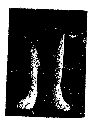
Fig. 4, Case 2.