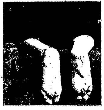
Fig. 3, Case 2.