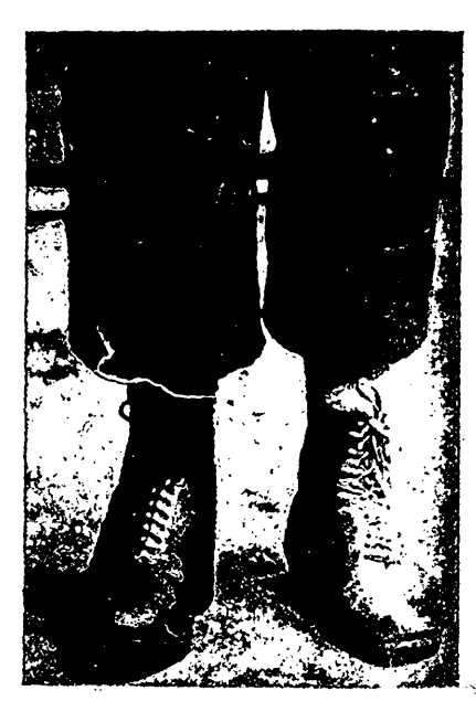
Fig. 5, Case 3.

Case 4. F. S., aged 16, right club-foot, congenital.