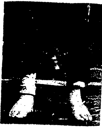
Fig. 2, Case 1.

Achillis was cut subcutaneously and the feet brought to an angle of 100 degrees and retained as before.