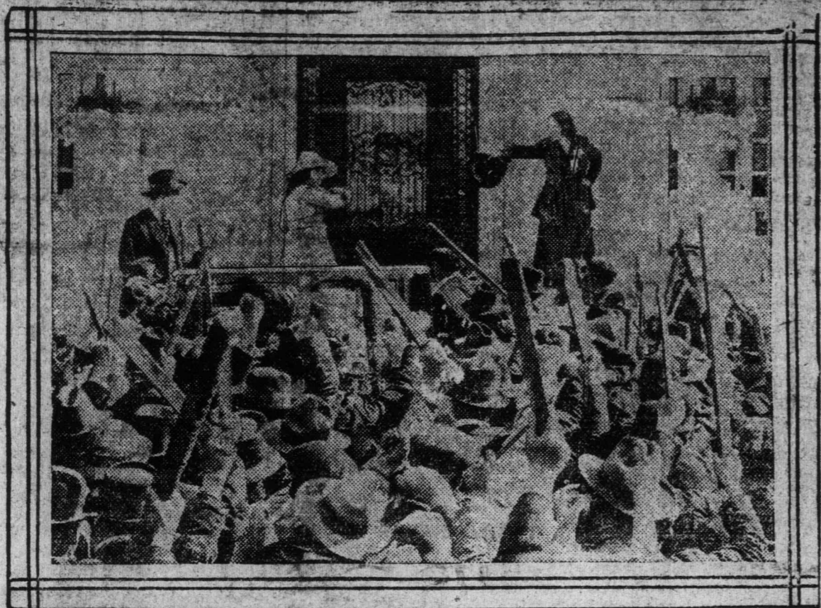
SCENE FROM THE BIG UNIVERSAL JEWEL PRODUCTION "THE RIGHT TO HAPPINESS" STARRING DOROTHY PHILLIPS GRAND, FIVE DAYS COMING TU ESDAY, JAN. 13TH. DAILY MAT INEE.